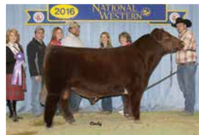
Sire - Proud As Hale 144