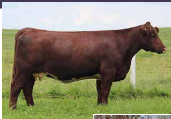
CF Cumberland 024 SOLX ET