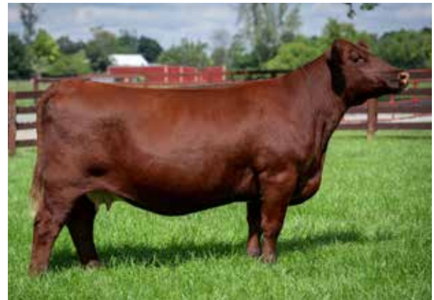
SULL Ruby is Red ET