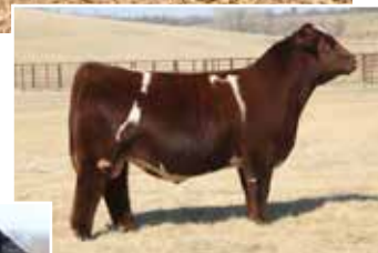
SULL Dream Maker 9141G ET