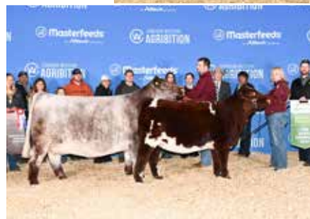
Donor - Millbrook Maria FB 6J ET