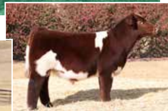
MFS Dream Weaver 37K