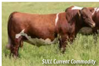
SULL Current Commodity