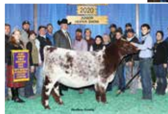
Lot B Full Sib - CF CSF Crystals Swan 015