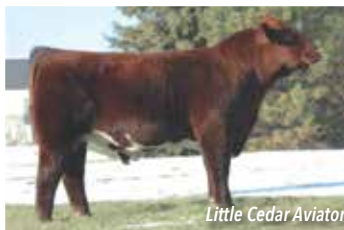
Little Cedar Aviator