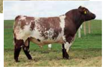
CSF Evolution HC