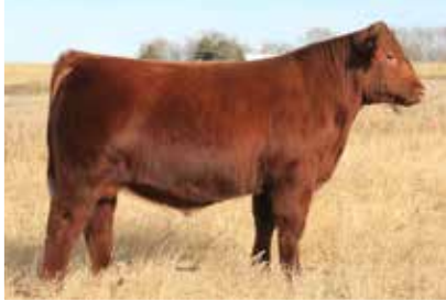
Sire - AA KANE Boulevard 679G ET