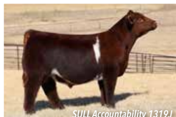
SULL Accountability 1319J