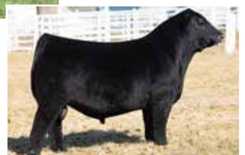
BNWZ Dignity 8017