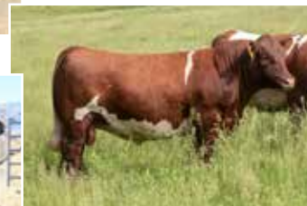
SULL Current Commodity 7630E