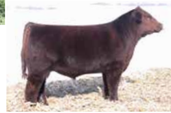
SULL Red Reward 9321