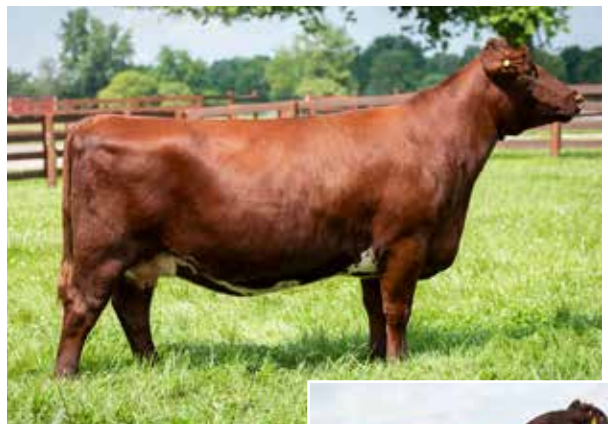
SULL Lucy's Gem 7690E ET