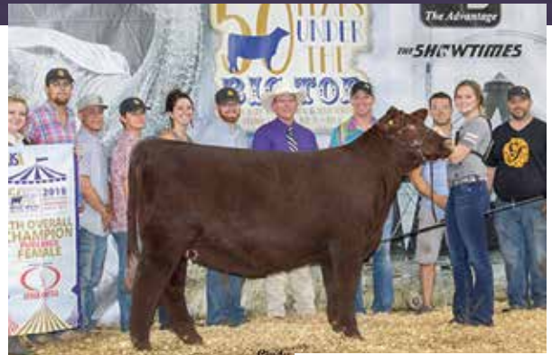
CF CSF Max Rosa 725 RR X ET