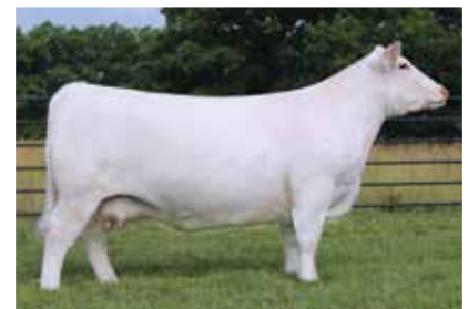
Dam - Armstrong Lady Crystal 2105 ET