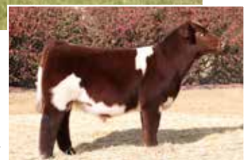
MFS Dream Weaver 37K