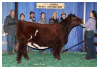
Wild Cheri Daughter's