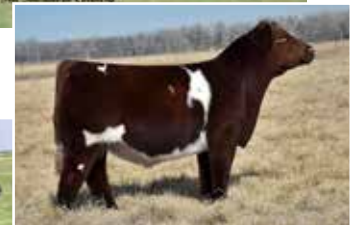
CF S/F Upper Hand X ET