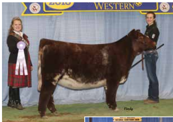
SULL Lucy's Right 7212E ET