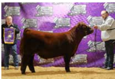
Division Champion 2023 Dixie National