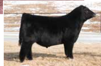
SULL Ferrari 6597D