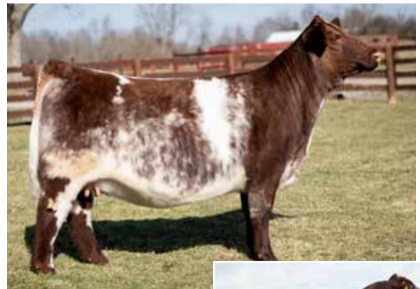
MFS Knighted Pinky the Roo 2142 ET