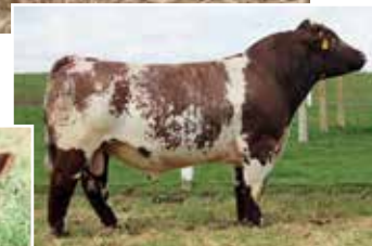
CSF Evolution HC