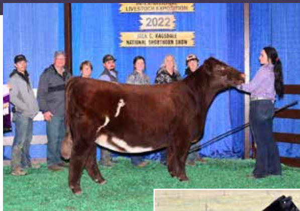
SULL MFS Dreamy Cherri 1014J ET