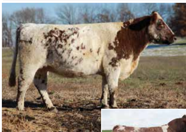
GNCC Mona Lisa 401X ET