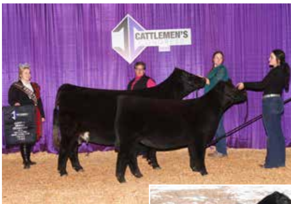
SULL S/T Cull Sweet Dreams 0510H ET

CONSIGNED BY: SUMMIT LIVESTOCK, KYIA HENDRICKSON 406-696-4517