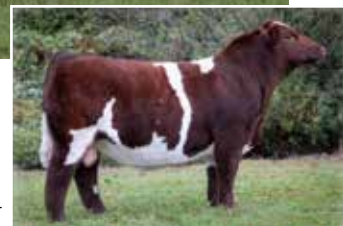
Direct Deposit 2254 ET