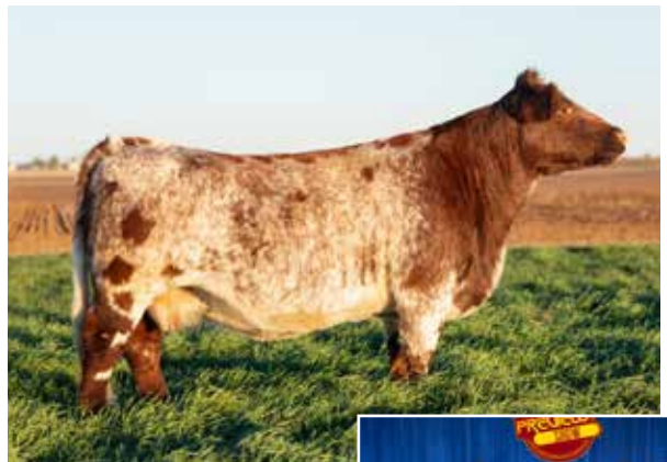
2G Demi's Desire C015 ET

CONSIGNED BY: MAC CATTLE CO / MACKENLEE EVANS, KATRINA EVANS 806-474-4136