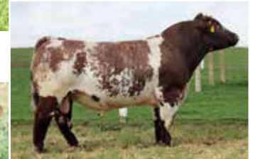
CSF Evolution HC