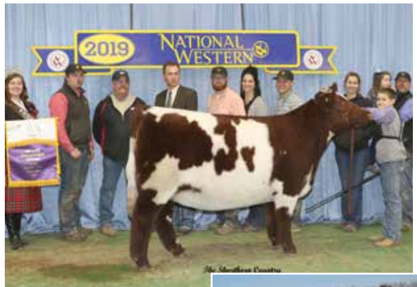
CF V8 Mona Lisa Reward 782 SOL ET