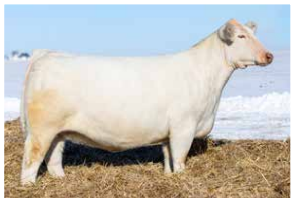
Dam - NF Fool Me Now