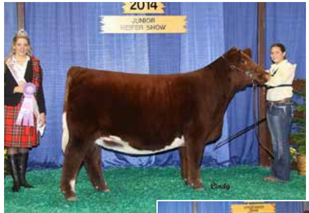
SULL Traveling Ruby ET