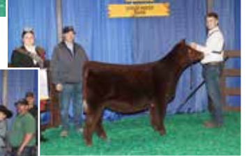
Full Sisters to Lot 28A