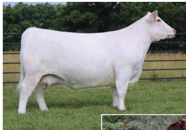
Armstrong Lady Crystal 2105 ET

CONSIGNED BY: ARMSTRONG FARMS, JOHN ALLEN 724-321-3163