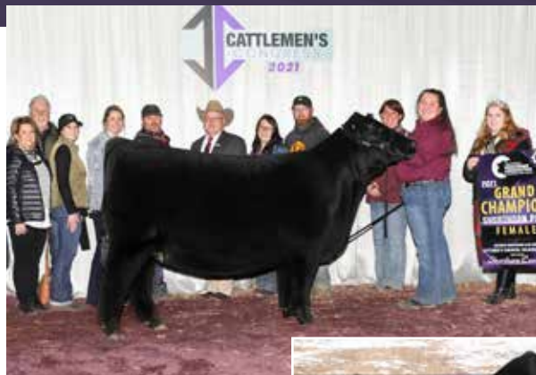
CF CSF Mona Lisa 934 Primo ET