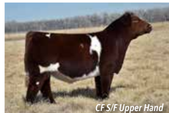
CF S/F Upper Hand