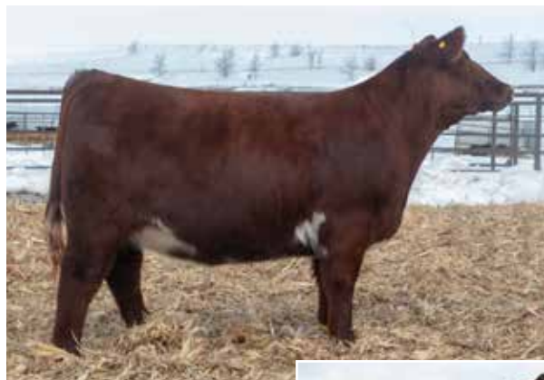
SULL Sapphire 7665E ET

CONSIGNED BY: GREENHORN CATTLE CO & TURNER FAMILY SHORTHORNS DAVE 937-470-6552, JOSH 937-681-1948