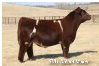
SULL Dream Maker

3 UNITS CONVENTIONAL SEMEN CONSIGNED BY: SULLIVAN FARMS