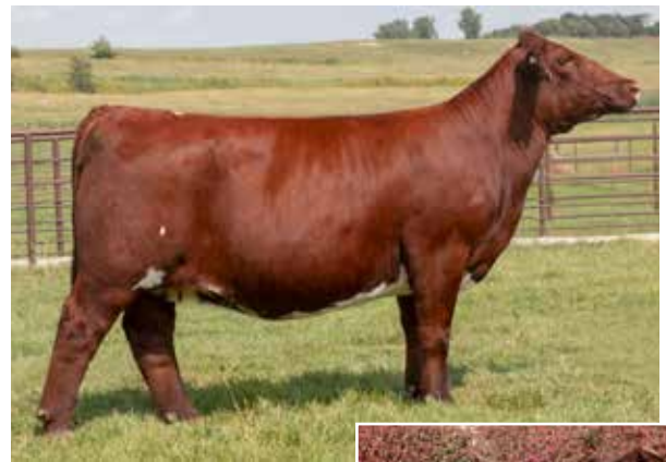
CYT DSC Max Rosa ET

CONSIGNED BY: BEACH FAMILY CATTLE, RYAN BEACH 402-269-5032