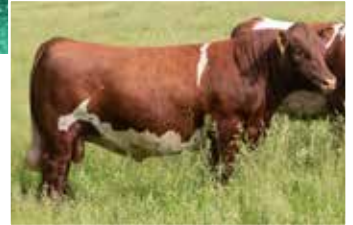
SULL Current Commodity 7630E