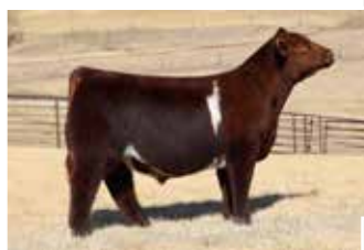
SULL Accountability 1319J ET

CONSIGNED BY: SULLIVAN FARMS, JOSH ELDER 402-650-1380