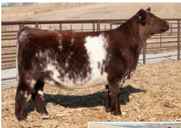
SULL Crystal's Lucys 8202F ET

CONSIGNED BY: GREENHORN CATTLE CO, DAVE 937-470-6552 & JOSH 937-681-1948