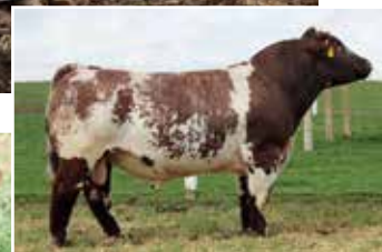
CSF Evolution HC