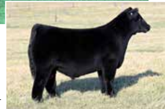
TJSC End Game 61G ET