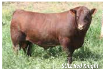
SULL Red Knight