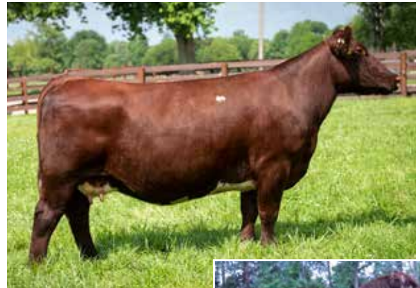
SULL Dream Only 7188E ET

CONSIGNED BY: GREENHORN CATTLE CO, DAVE 937-470-6552 & JOSH 937-681-1948