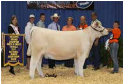
Dam's Maternal Sister