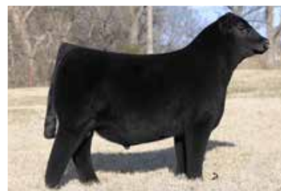
Sire - Conley No Limit