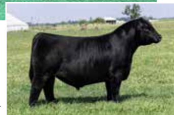
TSSC BT Limit Up 1099J ET