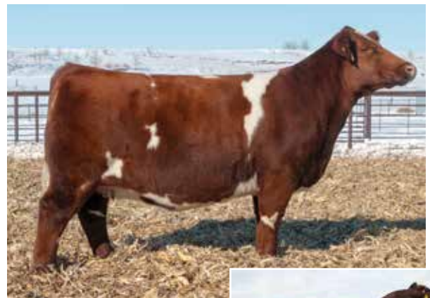
CYT Max Rosa Chrome 411 ET

CONSIGNED BY: BEACH FAMILY CATTLE, RYAN BEACH 402-269-5032