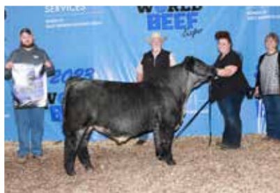
Reserve Champion ShorthornPlus Bull - 2023 World Beef Expo