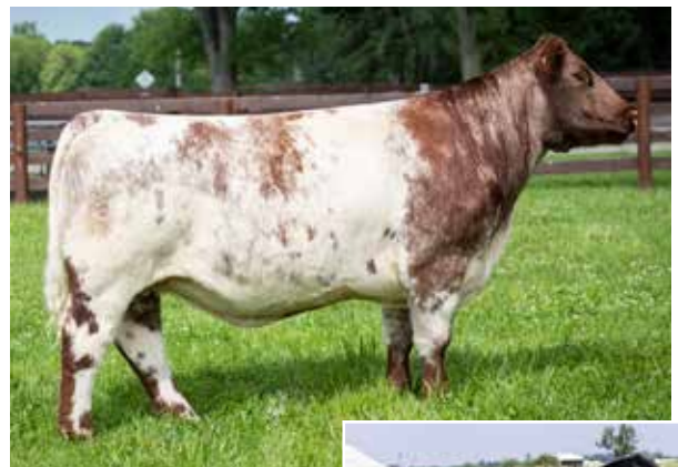
HVF MS Margie 7Z ET