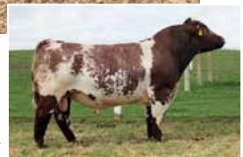
CSF Evolution HC