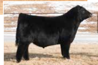
SULL Ferrari 6597D