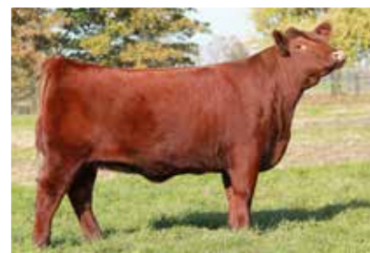
Dam - Waukaru Adelina 0111