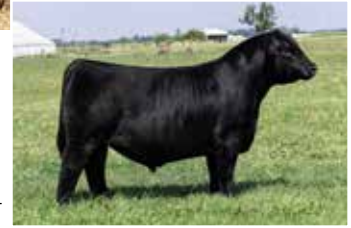
TSSC BT Limit Up 1099J ET