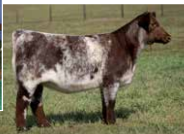
Full sib to lot 1 sold for $56,500