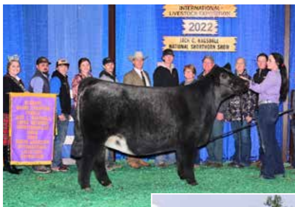
MFS CRPU Blue Diva The Roo 2108 ET

CONSIGNED BY: SUMMIT LIVESTOCK, KYIA HENDRICKSON 406-696-4517