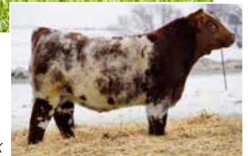
Gilman's Greens Fork 50K