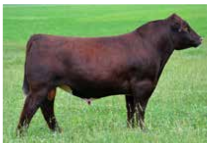
Sire - CF S/F Ultimate Reward ET