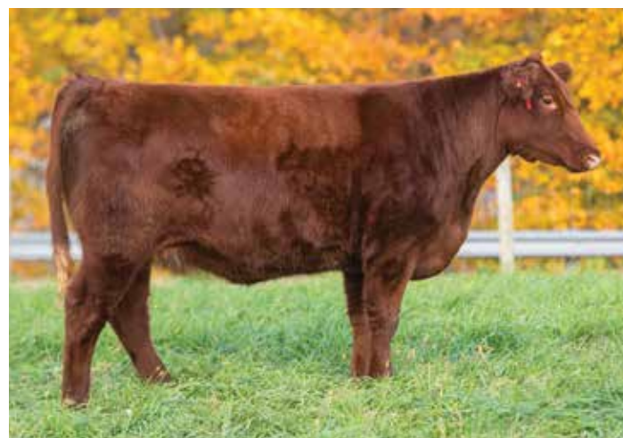
Donor - PVF Maude 6H

CONSIGNED BY: C SQUARED SHOW CATTLE, COLE STRICKLAND 252-908-2071