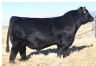
THSF Lover Boy B33