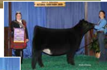
Lot A Full Sib - MFS Lucy's Masha 87L