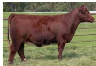
Dam - SULL Ruby Rose 7023E ET

A new unique mating here at Cagwin farms from the very foundation of our breeding program that combines some of the hottest pedigrees in the Shorthorn breed today. SULL Ruby Rose 7023 ET was recognized as a PACER performance dam at the annual Shorthorn meeting in Kansas City this year and is a direct daughter of the great RED TRAVELER 2405Z cow from Sullivans. She has proven time and time again to be our go to herd bull producer, raising offspring such as the calving ease phenomenon CCS Can't Stop 43J, and CCS Over Time 316H that is doing a tremendous job for Hill Shorthorns. CCS 1872 410L is the exact product that we had hoped for when we bred this cow to the $200,000 syndicated sire, Eighteen Seventy Two. He possesses the show ring presence and skeletal quality that we have come to expect from our Eighteen Seventy Two progeny and is interjected with the muscle shape and power that we have consistently seen from the Red Traveler cow family. Don't hesitate to own this intriguing Eighteen Seventy Two son that is sure to be a versatile breeding piece for any progressive breeder. Adj Birth Wt: 75 205-day Wt: 713