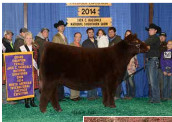
SULL Wild Cheri 3269 ET