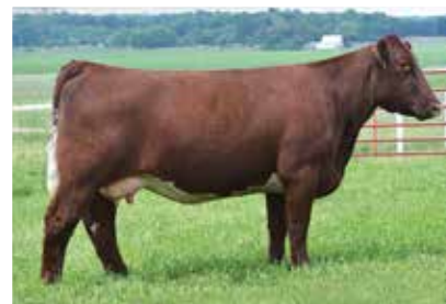
Dam - SULL Mona Lisa Reward ET