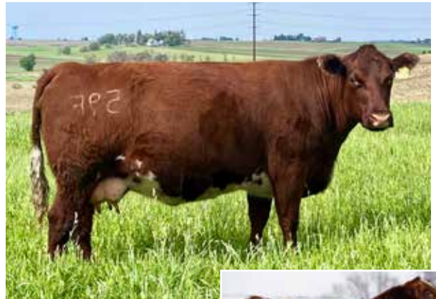
Gilman's Myrtle 59F ET