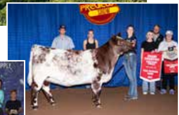
Full Sib to Lot 43A