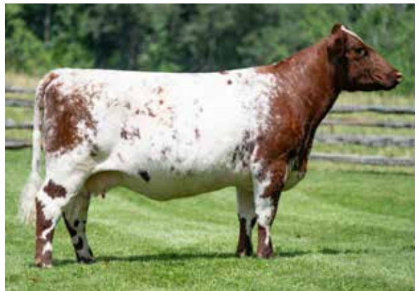
Hill Haven Breathtaker Sky 35G ET