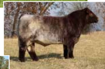
Millbrook Fireball 23F