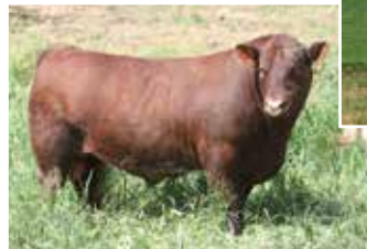
SULL Red Knight 2030 ET