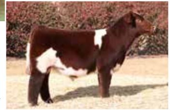
MFS Dream Weaver 37K