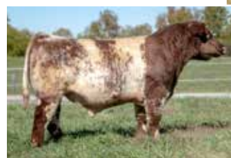
FSF Perfection 812