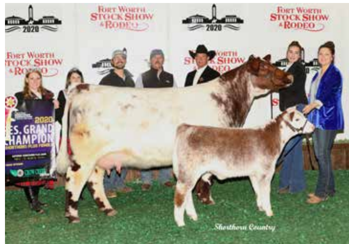
Donor - SULL Lady 7648E ET