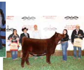
Sold for $47,000