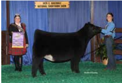
Full Sib to Lot 12