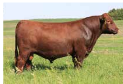
Sire - Kane Catwalk 685G ET

As a young breeder in this association we strive to bring high quality breeding pieces to offer genetic diversity and we believe this catwalk son does just that. His unique build and attractive profile combined with rib and body has us really excited for what he can do in the shorthorn industry. When it comes to his genetic makeup, his proof is not only in his sire's side but his dam's as well. This high caliber, large framed, and attractive female has already worked well in our program by producing the 2021 Grand Champion Shorthorn Heifer and the 2022 Reserve Grand Champion Shorthorn Heifer at OYE the world largest youth expo. We are excited to see what this young bull prospect can do in your program as the years go on.