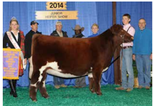
SULL Blooded Ruby 3278 ET