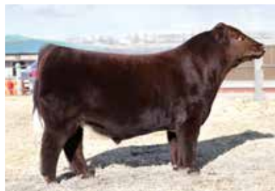
Sire - Little Cedar Worldwide 1979 ET