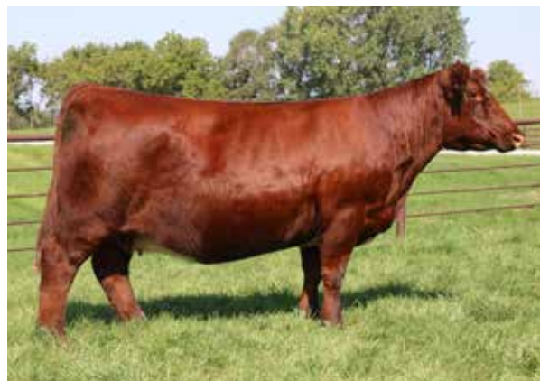
SULL Cheri 205 - 7 ET CL

CONSIGNED BY: SULLIVAN FARMS, JOSH ELDER 402-650-1380