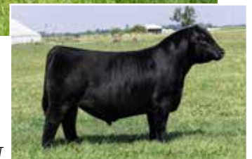
TSSC BT Limit Up 1099J ET