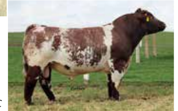
CSF Evolution HC