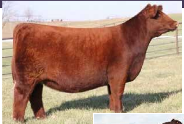
SULL Miss America 6073D ET