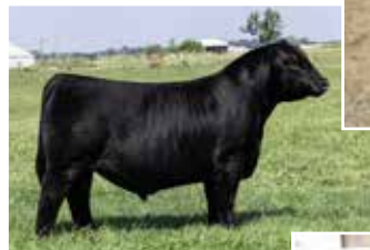
TSSC BT Limit Up 1099J ET