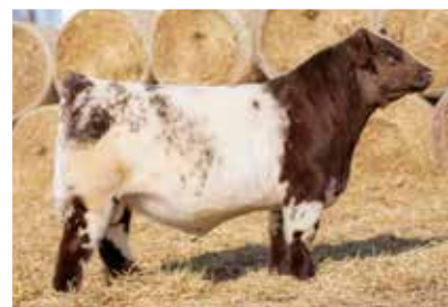
Sire - Eighteen Seventy Two