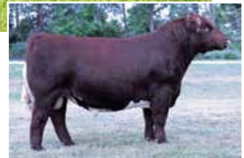
Little Cedar WF Lookout 2160