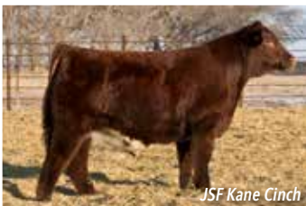
JSF Kane Cinch

5 UNITS CONVENTIONAL SEMEN CONSIGNED BY: MCKAY FARMS