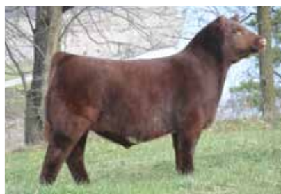
Sire - CF Payweight X ET