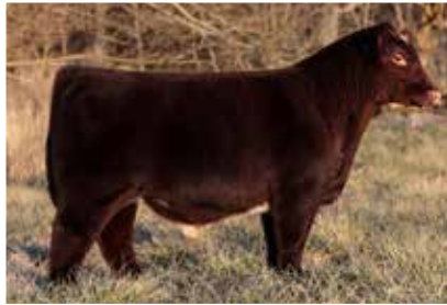
Sire - SFF Ragweed 003 B ET