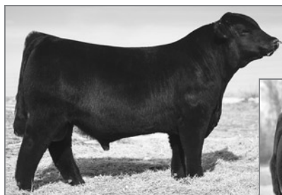
BOE Gronc ET Sire of Lot 49A embryos

BOE GARTH MISS BOE 502R NAGE ANTE UP 70Z BOE POLLY SLC SOONER 101M GVC SAMANTHA 591R NAGE WIDE TRACK 94J MISS GREEN VALLEY 007K