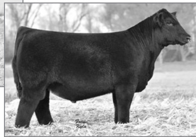
BBR Memphis Mafia 3E ET Sire of Lot 49B embryos