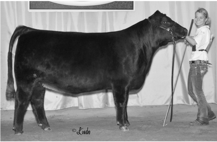
Full sister to dam of Lots 49A and 49B embryos