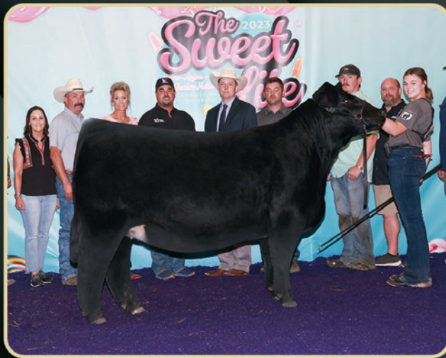
GAME ON X AIN'T HIGH 3015 SELLING FULL SIB EMBRYOS TO THIS CHAMPION

SELECT LIVE LOTS, FLUSH OPPORTUNITIES, EMBRYOS AND RARE SEMEN