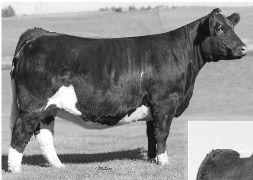
TLLC Sassy Sophia ET Lot 48A Buyer's Choice Flush Donor