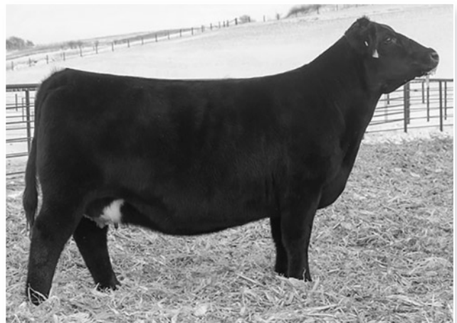
BNWZ SULL Calypso 708C Dam of Lot 5

• Selling 2/3 semen interest and full possession. Seller retains 1/3 semen interest. • A direct son of Memphis Mafia out of a prolific flush mate sister to BNWZ Data Bank that has all the basic fundamentals, correctness and the look we all desire. His donor dam, "Caly," as we call her, stems from the prolific Sullivan Farms program and has stepped into our donor rotation, producing two national champion Maine Angus females in three short years as well as division winners at majors across the country. Daughters have averaged well for us, with an Epic daughter topping the list at $40,000 to Clark Cattle of Texas. This is the first male offspring produced from Caly, and we are simply elated at the quality she has given us once again. Each year our industry searches for the next sire that has the ability to be a difference maker, and we truly believe Rags to Riches is just that sire! The most sought after and proven bloodline available within the breed, all wrapped up in a very rare purebred and low birth weight package. We believe that Rags to Riches has what it takes to be the next great go-to heifer safe promotional sire. He will be heavily used within our operations.