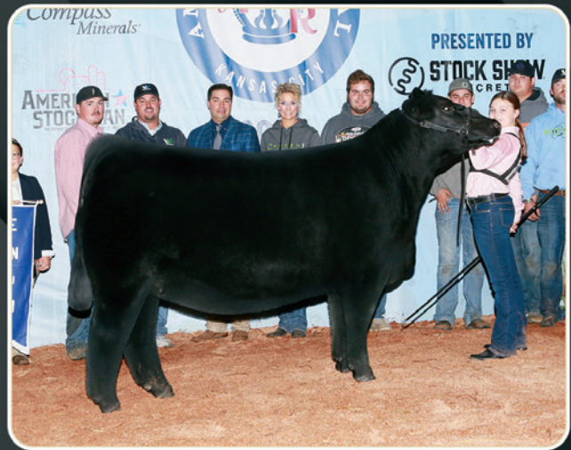
MAFIA X GVC SHANIA 80Z SELLING FULL & MATERNAL SIB EMBRYOS TO THIS CHAMPION