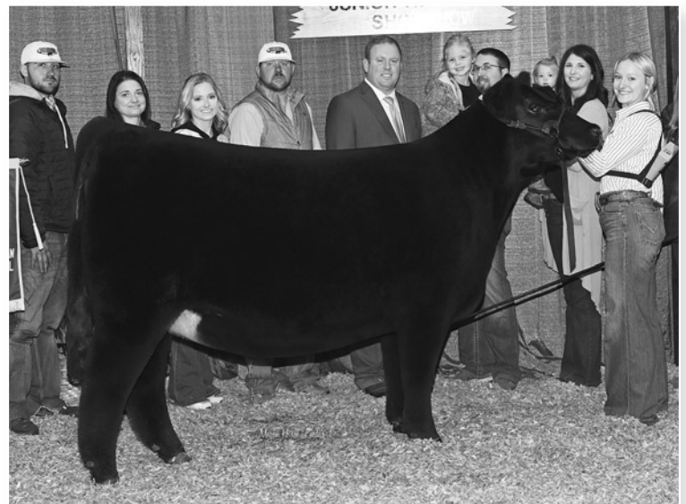
Maternal sister to Lot 52