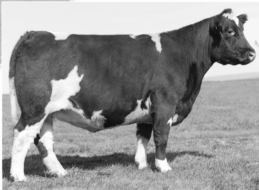
FCF Sequel 7201E Lot 48B Buyer's Choice Flush Donor

Thank you to the Loudon Family for proudly donating 10% of the net proceeds of the Lot 48 IVF cycle to the Junior Maine-Anjou Fullblood Program!