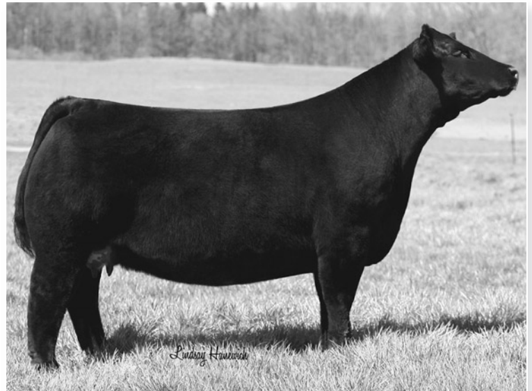
SBSC Day Dreamer 410Z ET "Skelli" Dam of Lot 26