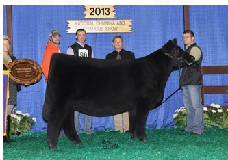
JSUL Who Dat Lady 2037Z Dam of Lot 10

This direct daughter out of the great Who Dat Lady 2037Z exudes pure class. There won't be a longer, more elegant fronted Chianina female to sell all year. One of her most unique qualities is being ultra long sided, all while not giving up any shape in her underline. When you set her in motion her big long strides allow her to move comfortably and with conviction. And we'd be remiss if we didn't mention that she is super shaggy...hair will never be an issue here! Being just a May born, she gives a youthful look with a ton of future ahead. She will certainly add to the long list of Who Dat Lady daughters who have beaten a path directly to the backdrop. Who Dat Lady 2037Z (a former National Champion) is close to amassing $2 million in progeny raised, and daughters like this one are the reason why.