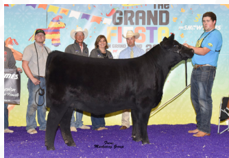
NIKL Cobra 703E Dam of Lot 5

Awesome High % Chi herd sire prospect here. Full brother to a past high selling female. His grand dam has been the stable of our Chianina donors, and his Dam was the Supreme Bred & Owned Female at Junior Nationals in 2018. Big, stout, burly type of a bull that still offers plenty of look and balance.