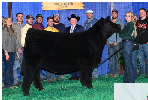
TUBB/TSSC Larissa Who 201K – Who Da Man Daughter