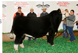
TFRK Gunslinger 052H Classic Doc Holiday Son