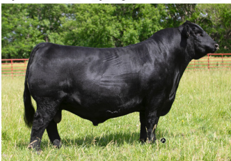
Silveiras Forbes 8088 Service Sire of Lot 16