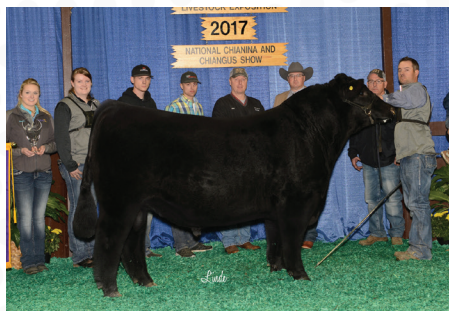
BMW Onset Full Sib in Blood to Lot 1

This full sib in blood to BMW Onset is an incredible animal. The amount of power, balance and structural correctness is next level. Along with his amazing phenotype genetically, this bull should make incredible high % Chianina cattle that will perform and be right for the times.