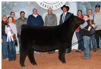
PCC Who Dat Raptor 130L ET Full sib to Lot 16 embryos

Guarantee of at least one pregnancy to result if implanted within one year by a certified embryologist.