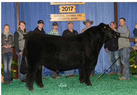
BMW Onset Who Da Man Son Grand Champion Chianina Bull – 2017 ACA National Show

Here is the chance to purchase one straw of semen on one of the hottest bulls in the industry right now. Who Da Man semen is hard to come by, so don't let this opportunity pass you by. His progeny are topping shows all over the country and embryos mated to him are bringing top dollar in sales. Look in here for the opportunity to take your operation to the next level.