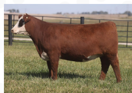
Classic Doc Holiday Daughter