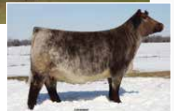
9114's Full Sister CF Margie 119 SOL X ET