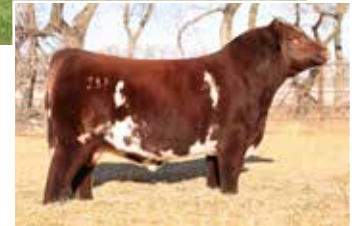
GCF JW 101J