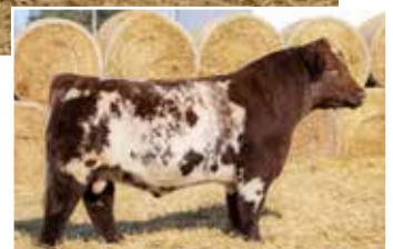
Byland Flash 9U106