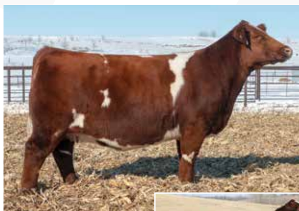
CYT Max Rosa Chrome 411 ET