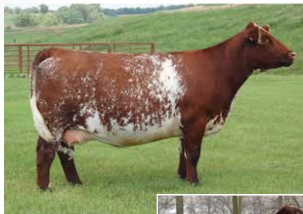
Grandam - SULL Crystal's Lucy ET