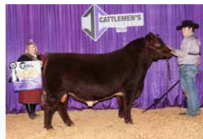
Sire - SFF Ragweed 003 B ET