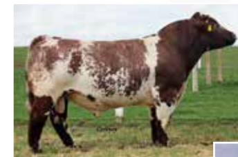
CSF Evolution HC