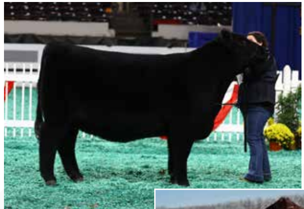
SJQ Demi 2002 Primo X ET

CONSIGNED BY: SAJO-QUIN LIVESTOCK, JOSHUA MUMMERT: 717-729-3151