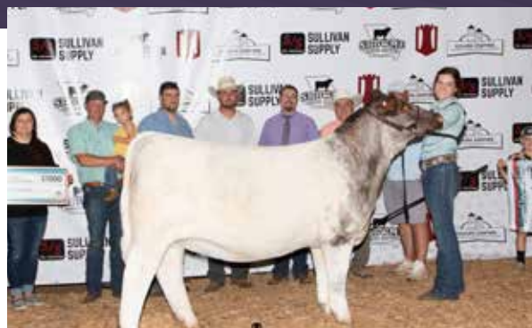
CG Diana's Final Reward 122J ET