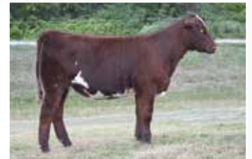
Top selling Aviator daughter