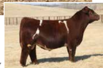
SULL Dream Maker 9141G ET