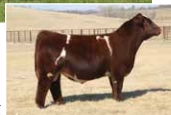
SULL Dream Maker 9141G ET