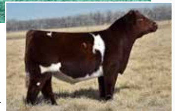
CF S/F Upper Hand X ET