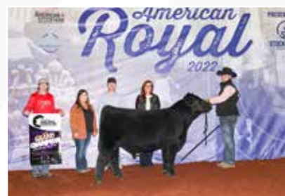
Grand Champion ShorthornPlus Bull 2022 American Royal