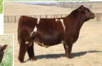
SULL Dream Maker 9141G ET