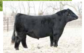
ACLL Fortune 393D