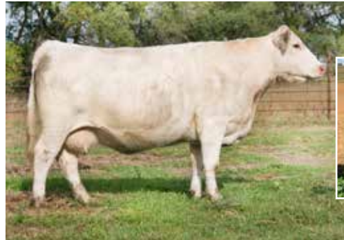
Dam - ND Orange Blossom 26X3

CONSIGNED BY: JUNGELS SHORTHORN FARM, DEREK: 701-238-4362