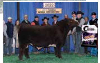
Little Cedar WF Lookout 2160