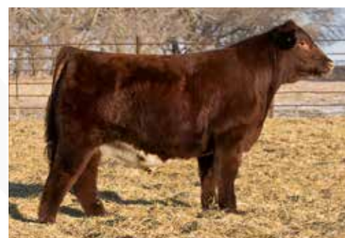
Sire - JSF Kane Cinch 61H

What an absolutely exciting time to be a Shorthorn breeder it is right now. Our junior program and show cattle market is at an all time peak. Our bull market and commercial acceptance is at the highest level that I have seen it in my lifetime. I believe we as Shorthorn breeders, as well as our breed leadership, have done an excellent job of unifying our breeders to produce a more versatile product. I believe CF Crossover can get us just that much closer. He is bred to be a true calving ease sire that doesn't sacrifice growth numbers. He is uniquely bred for a lot of the breed with very strong maternal bred in. He looks like a show bull. He is perfect structured great looking with tremendous body and incredible muscle from behind. I think this bull can continue to help unite the cattle and breeders of our breed and further the greatness of our product we offer to all facets.