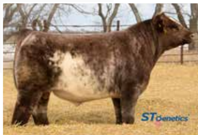
Sire - JSF Ronan 5H

CONSIGNED BY: BERG SHORTHORNS, JOSH: 641-832-7772