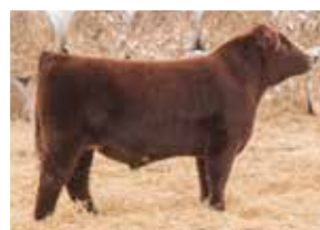
PVF Justice 3G