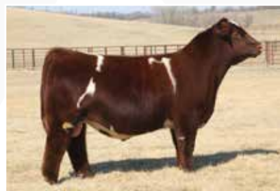
Sire - SULL Dream Maker 9141G ET