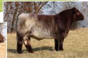
Millbrook Fireball 23F