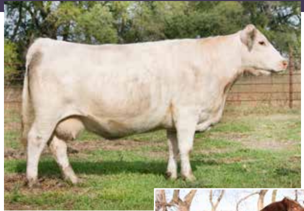
ND Orange Blossom 26X3

CONSIGNED BY: JUNGELS SHORTHORN FARM, DEREK: 701-238-4362