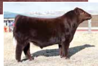
Little Cedar Worldwide 1979 ET