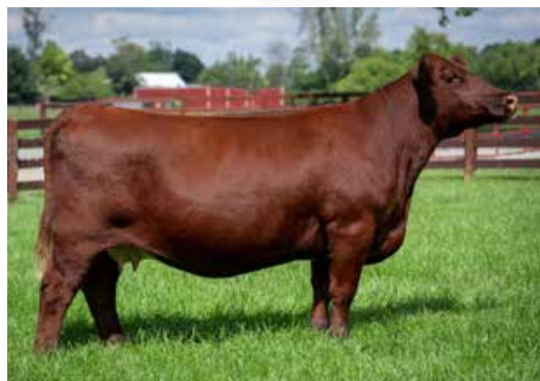
SULL Ruby is Red ET