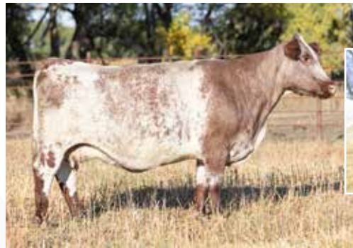
Dam - JSF Marvel 80W