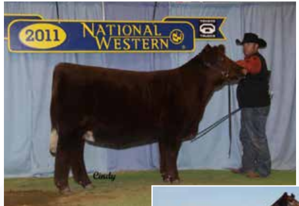
CF Margie 9114 SOL ET

CONSIGNED BY: BAYLOR COWDEN SHOW CATTLE/HORNHEAD VALLEY FARM, DREW COWDEN: 724-255-7283