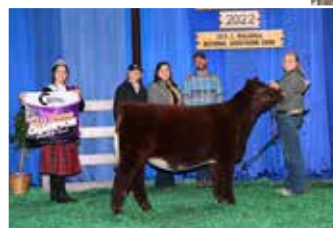
Half Sib - Bergs Mylie Myrtle Bo