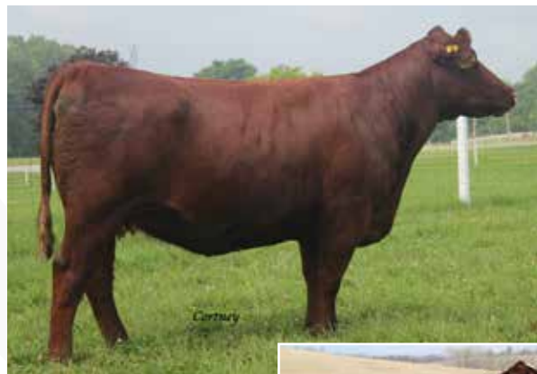
CF HHF Margie 895 BW ET