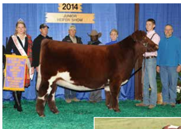
SULL Blooded Ruby 3278 ET