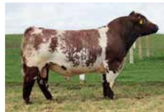
CSF Evolution HC