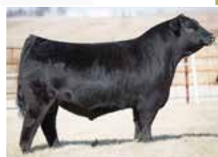
TGM Compton 1738