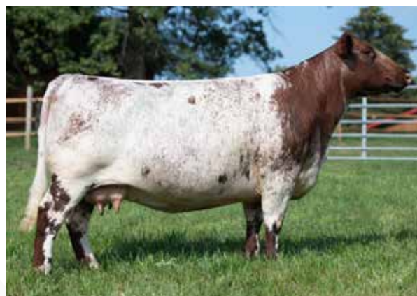
CYT Celine MX 3130 ET