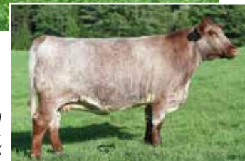
Maternal Grandam - SBF Perfect Millie 23X