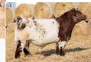
Eighteen Seventy Two