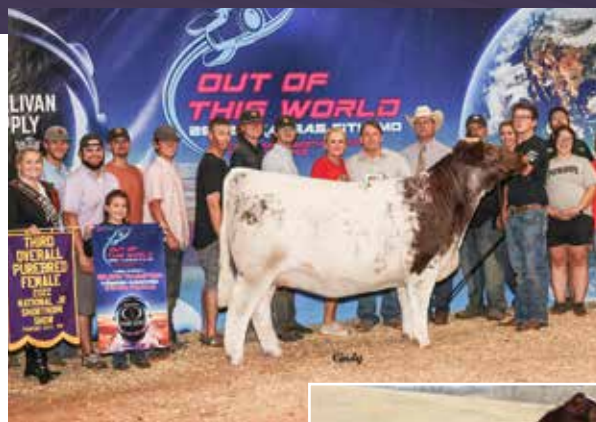
CF Mona Lisa 0121 SOL X ET