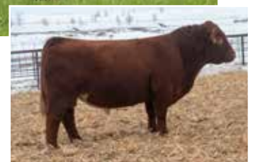
SULL Red Blood