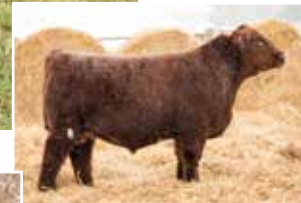
PVF Finding Favor 5E