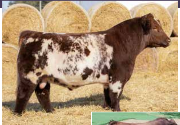
Full Sib - Byland Flash 9U106

CONSIGNED BY: BYLAND, JEFF BYERS: 419-651-7293 & JON BYERS: 419-651-0501