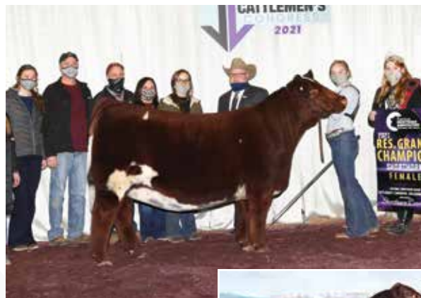
BFS Margie LL 950