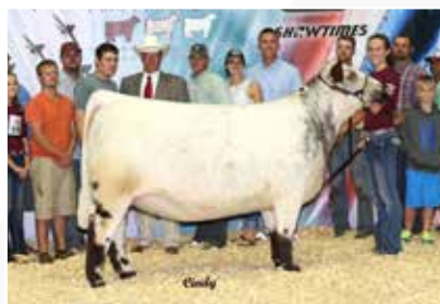
Dam - SULL Bo's Knight 5804 ET