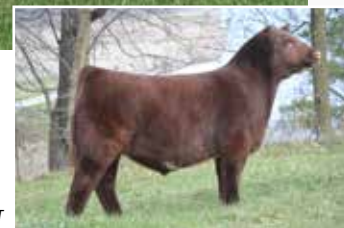
CF Payweight X ET