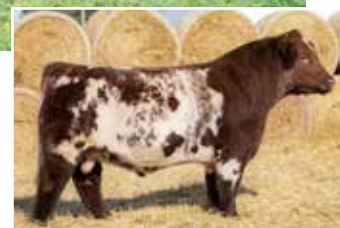
Byland Flash 9U106