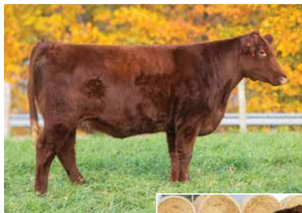
PVF Maude 6H

CONSIGNED BY: C SQUARED SHOW CATTLE, COLE STRICKLAND: 252-908-2071