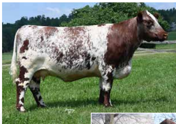
Shadybrook Perfect Spice 2E