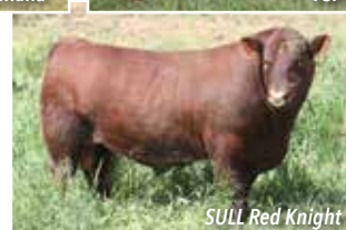
SULL Red Knight