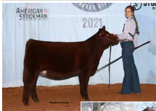
LDB Dreamy Knight 109 ET

CONSIGNED BY: 4S FARMS, ANDY SCOTT: 405-650-2798