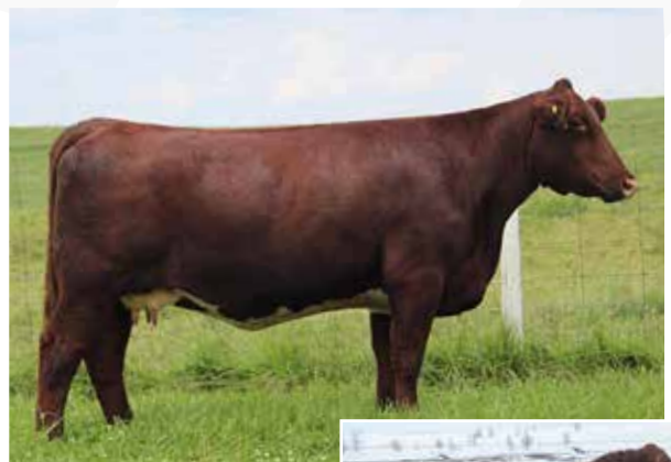
CF Cumberland 024 SOL X ET

CONSIGNED BY: HARPER FARMS, NICK: 330-827-0660