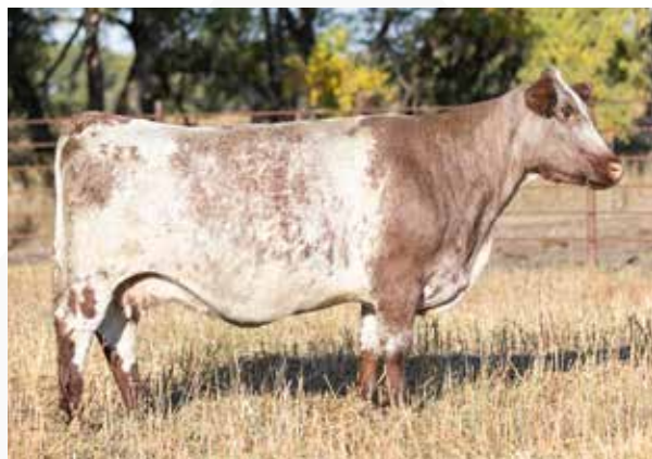
JSF Marvel 80W