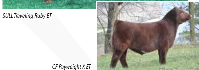
CF Payweight X ET

CONSIGNED BY: GREENHORN CATTLE CO., DAVE: 937-470-6552 & JOSH: 937-681-1948