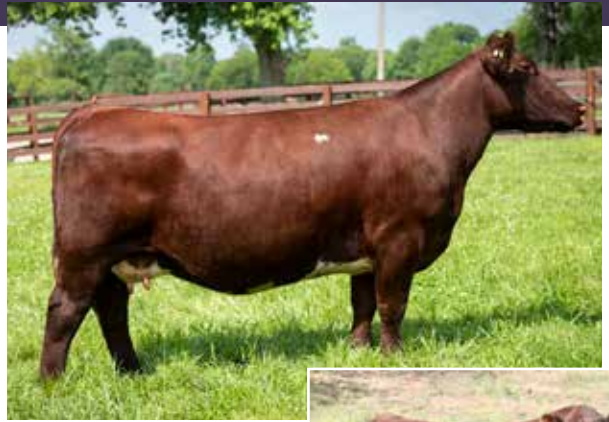
SULL Dream Only 7188E ET

LOT 53C CONSIGNED BY: GREENHORN CATTLE CO, DAVE: 937-470-6552, JOSH: 937-681-1948