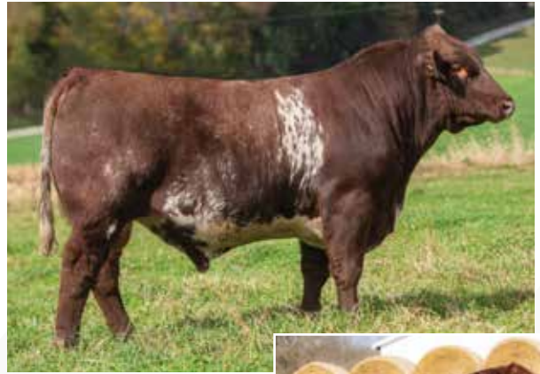
Full Sib - Byland Top Dog OSD40

CONSIGNED BY: BYLAND, JEFF BYERS: 419-651-7293 & JON BYERS: 419-651-0501