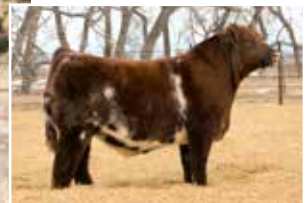
JSF Palermo 172H ET