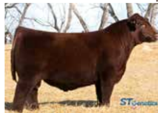
JSF Time's Square 120G ET