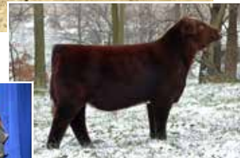
CF S/F Park Place X ET