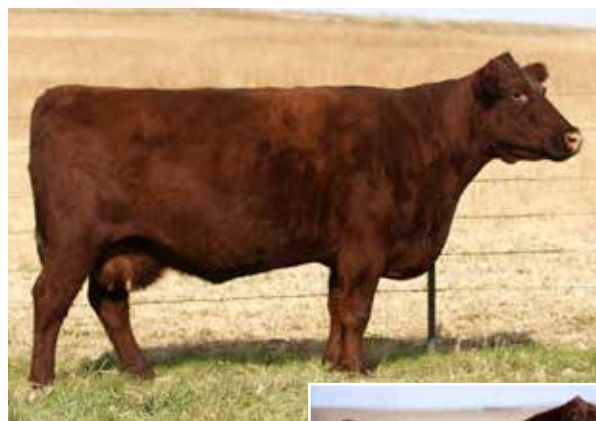
JSF Ruby 46Y