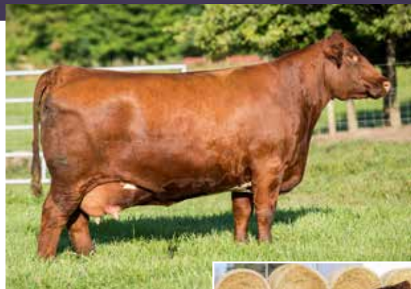
Waukaru Lassie 2024

CONSIGNED BY: BOWMAN SUPERIOR GENETICS, PHIL: 765-886-5777 & LUKE: 765-993-6681