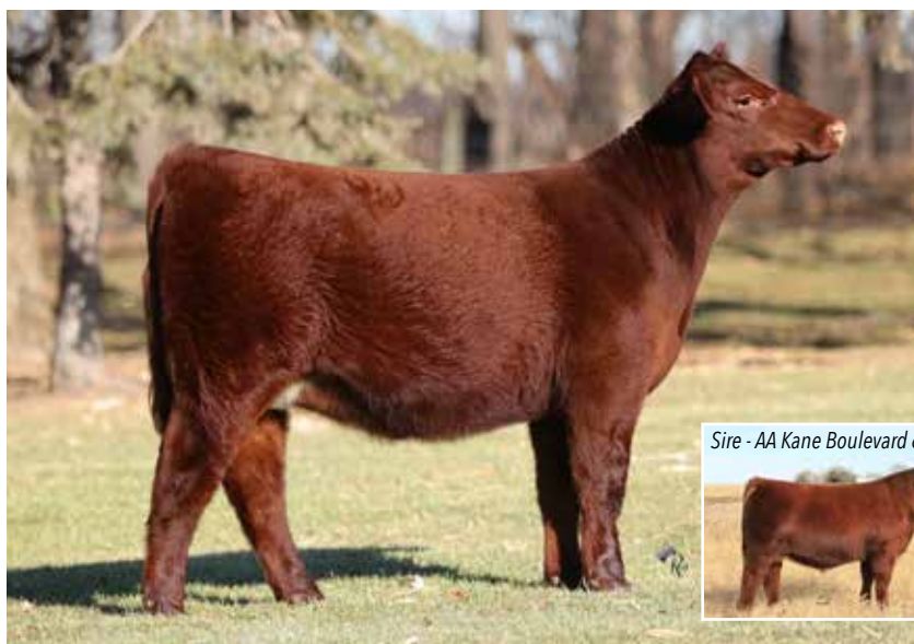
Sire - AA Kane Boulevard 679G ET