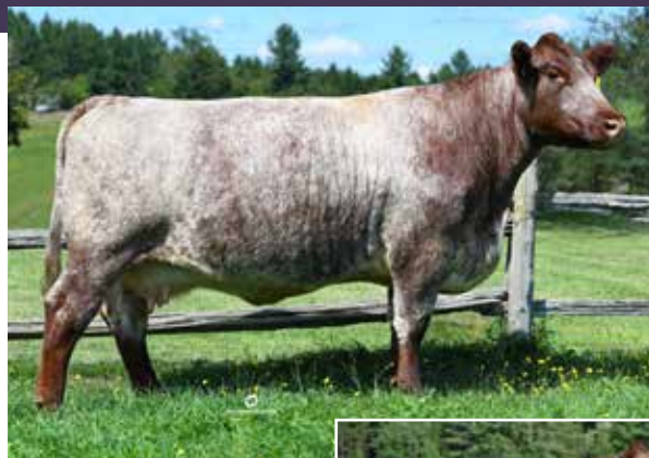
SBF Shadybrook Perfect 20 ET