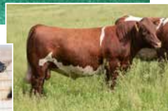
SULL Current Commodity 7630E