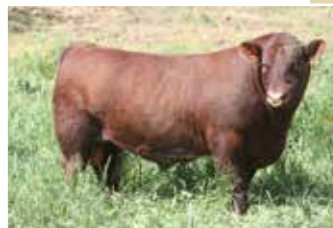
SULL Red Knight 2030 ET