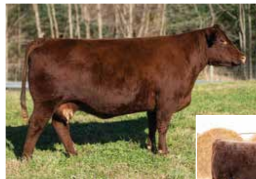
Dam - PVF Beauty Queen 56Z

CONSIGNED BY: PAINT VALLEY FARMS, LEE MILLER: 330-231-6834