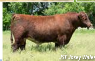
JSF Josey Wales