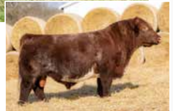
Byland Soggy Dog 7TM73