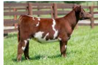
$17,000 Current Commodity daughter