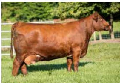
Dam - Waukaru Lassie 2024