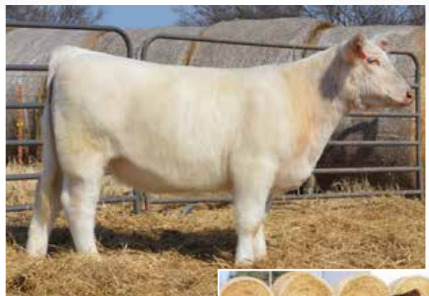
2G Demi Divine BS C008 ET

CONSIGNED BY: SAJO-QUIN LIVESTOCK, JOSHUA MUMMERT: 717-729-3151