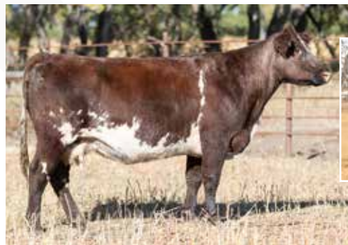
Dam - JSF Miss Perfection 79B