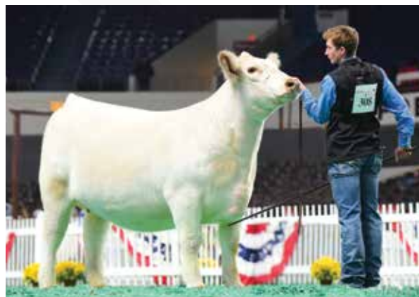
Armstrong Lady Crystal 2105 ET

CONSIGNED BY: ARMSTRONG FARMS, JOHN ALLEN: 724-321-3163