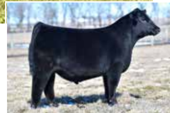
PVF Marvel 9185