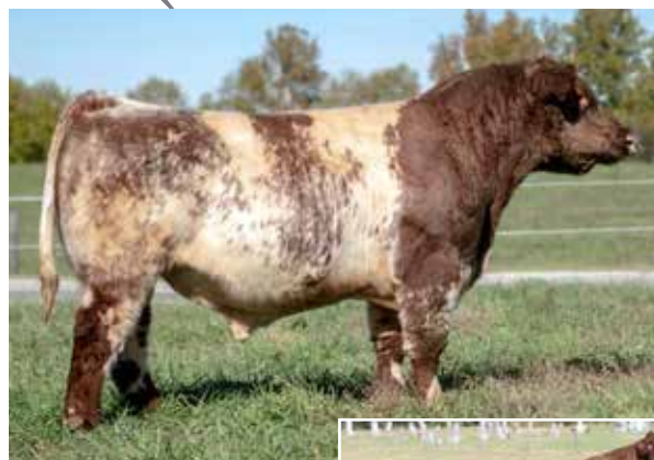
FSF Perfection 812

CONSIGNED BY: TURNER SHORTHORNS, TOM & SUSIE TURNER: 614-499-5248