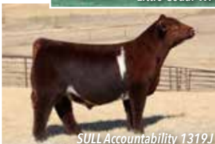
SULL Accountability 1319J