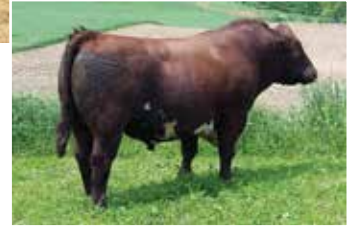
Studer's Universal 10B