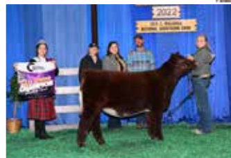
Half Sib - Bergs Mylie Myrtle Bo