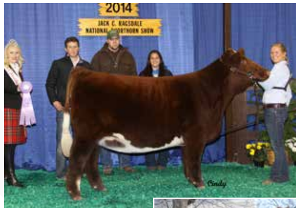
SULL Traveling Ruby ET