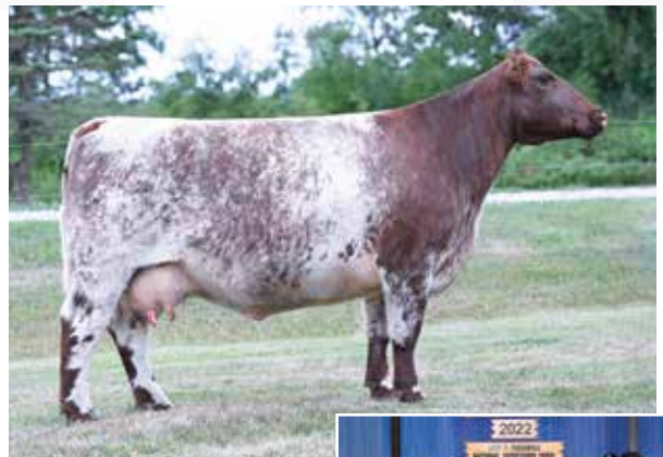
WAT Bobby's Primo Girl 120E