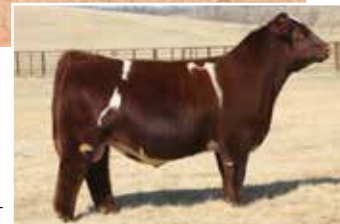
SULL Dream Maker 9141G ET