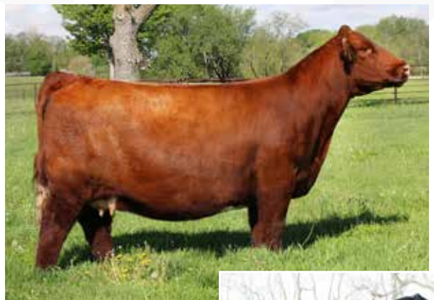
SS Dream Lady 161 ET

CONSIGNED BY: SULLIVAN FARMS, JOSH ELDER: 402-650-1380