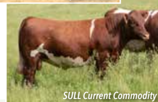
SULL Current Commodity