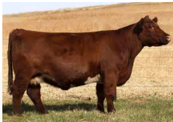
Gilman's Maystar Rosewood 39G