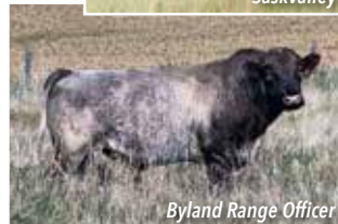
Byland Range Officer