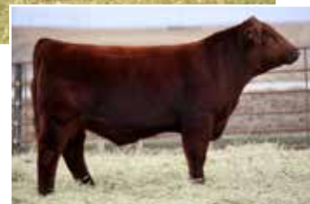
Gilman's Big Bank 34H