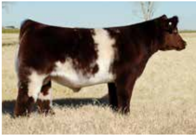
Sire - FSF Starburst 058