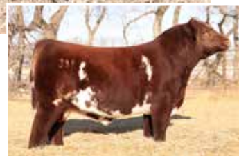
GCF JW 101J