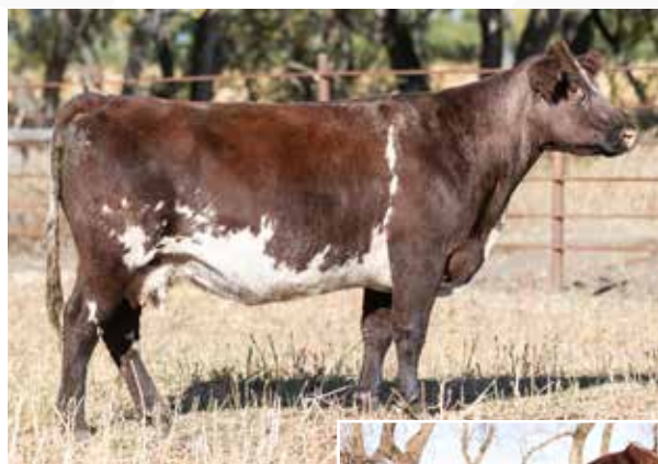
JSF Miss Perfection 79B