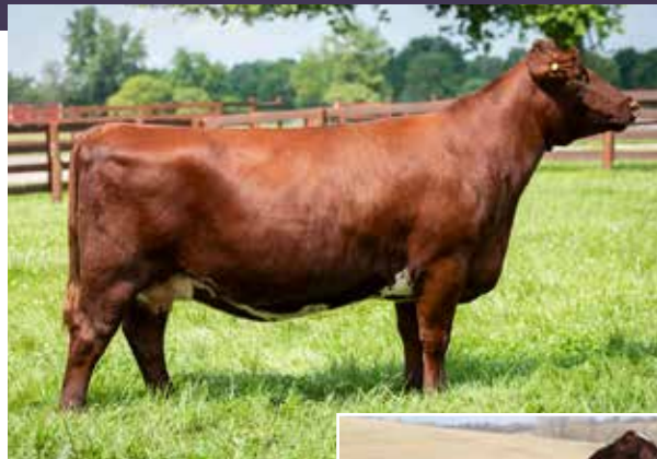
SULL Lucy's Gem 7690E ET