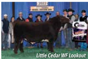
Little Cedar WF Lookout