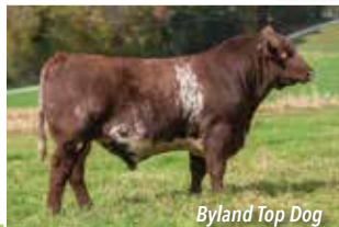
Byland Top Dog