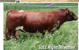
SULL Right Direction