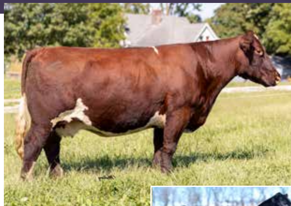
AF Playful Cait 902

CONSIGNED BY: HARPER FARMS, NICK: 330-827-0660