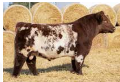
Sire - Byland Flash 9U106