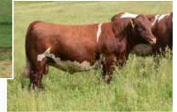
SULL Current Commodity 7630E