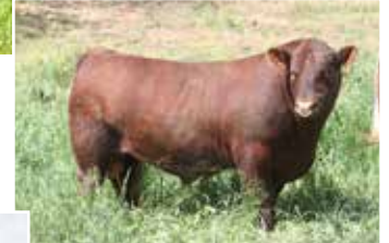
SULL Red Knight 2030 ET