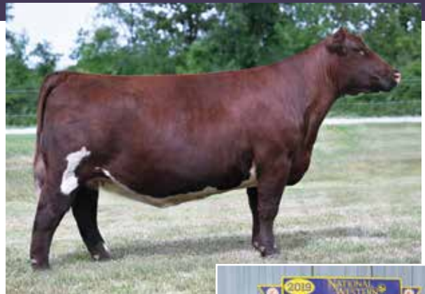
SULL Martha's Bo 7974E ET

CONSIGNED BY: WALKER FARMS, TROY: 765-601-3451