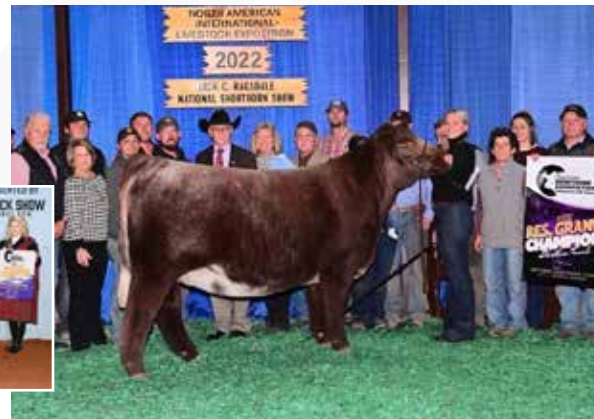
Dam - CF CSF Dream Lady 135 EV X ET