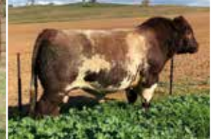
Royalla Rockstar K274