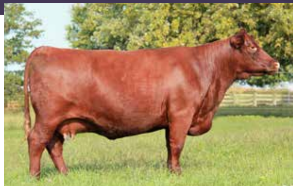
Waukaru Minnie 5214

CONSIGNED BY: NOBLE LAND & CATTLE INC., CHAD NOBLE: 559-359-9893