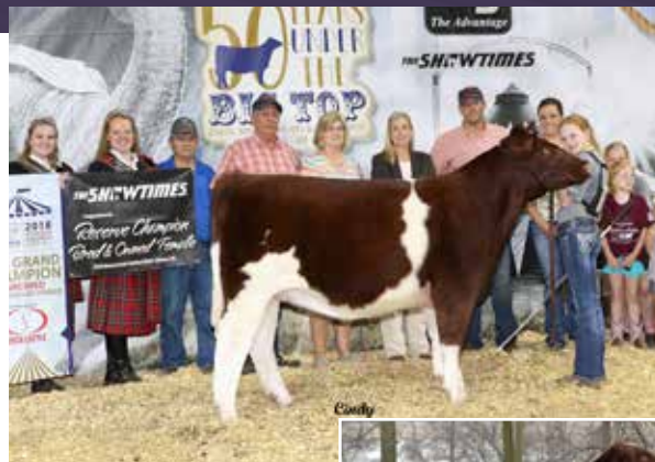
Bergs Sweet Katie