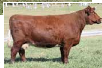
FSF Sierra Crystal