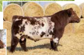
Byland Flash 9U106