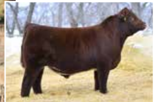
JSF Foreplay 168J