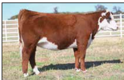
Lot 21B – SHR 105H EDEN 2323 ET