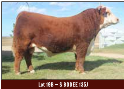
Lot 19B – S BODEE 135J