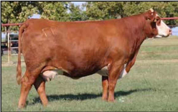
77 MISS ELLISON 16E 80F