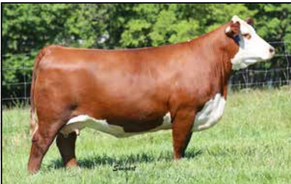
TH 329 358C LANA 76E