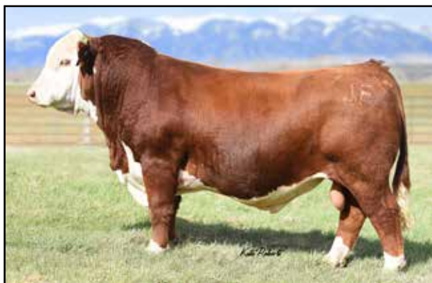
NJW LONG HAUL 36E ET – Sire of Females