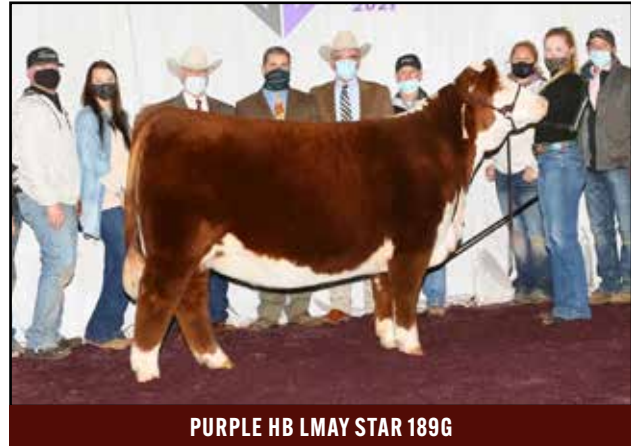
PURPLE HB LMay STAR 189G