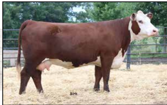
FTF VERONICA 227Z

Maternal grandmother to many of the females available.