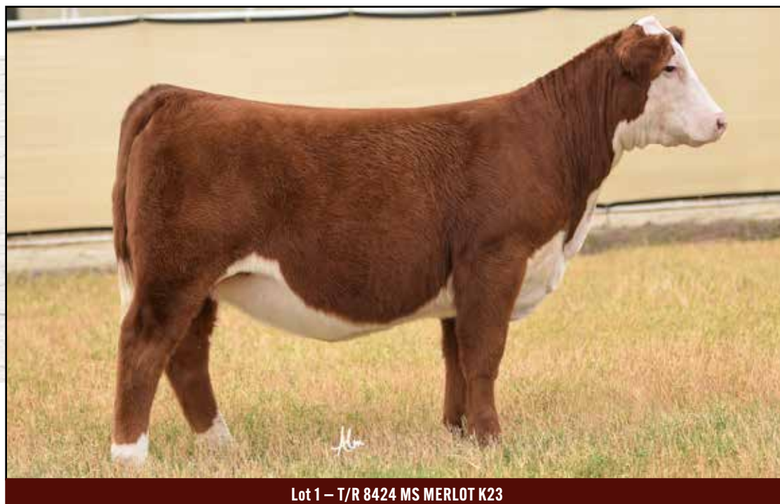
Lot 1 – T/R 8424 MS MERLOT K23