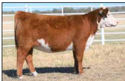
Lot 21A – SHR 105H EDEN 2189 ET

Offering choice in these powerful sisters. Sell open.