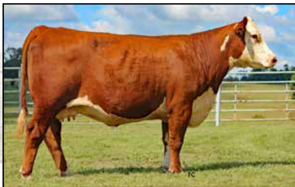
FTF MS FRONTIER 910G

Grandmother to many of the 2-year-old females available.