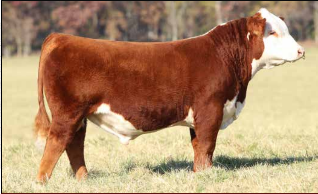
Lot 15 – PERKS 2TK 5101 JABARI 1122 ET