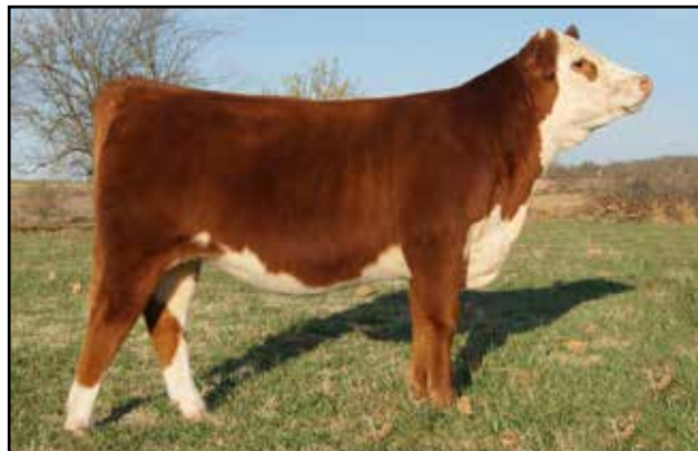
Lot 13B – THA 66589 ABILENE 023J ET