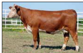
GRNDVW CMR 156T BETH Y505 ET Dam of Lot 23A and 23C