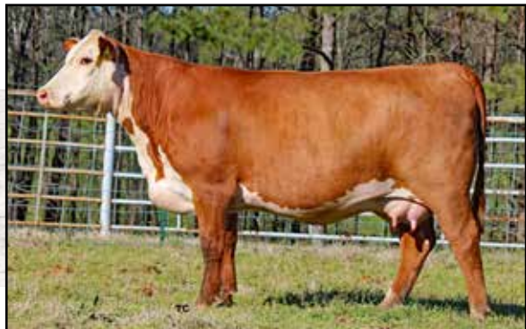
WHR 4013 820C BEEFMAID 659F