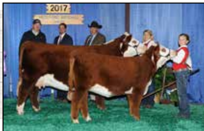
PERKS 2029 COPPER LADY 5101