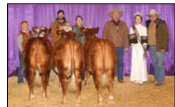
2021 Cattleman's Congress Champion Senior Heifer Calves