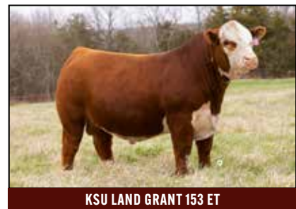
KSU LAND GRANT 153 ET