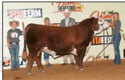
2TK PERKS 5101 CHUMA 8184 ET