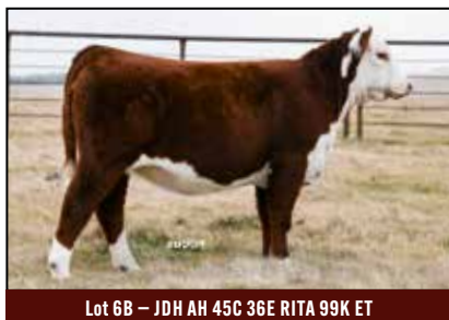
Lot 6B – JDH AH 45C 36E RITA 99K ET