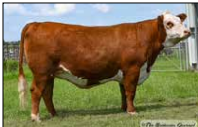
Lot 23C – VO TDF MISS BETH 070 J ET