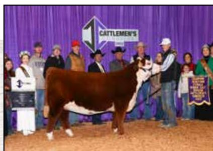
H PIXIE 0635 ET

2022 Cattlemen's Congress Champion Horned Female