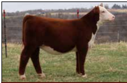
Lot 17D - LFF 104Z KRISTEN 232K ET