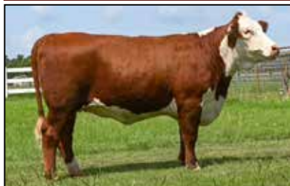
Lot 23D – VO TDF BECKY 073J ET