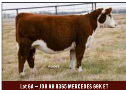
Lot 6A – JDH AH 9365 MERCEDES 69K ET

Again, this year we are offering you the choice of the three heifers in our pen. This year's choice includes heifers from our top donors and a heifer from a female that we sold in the Mile High Eve sale several years ago. These females have the ability to show but more importantly go on to make an impact on the future of your herd as a top donor! Delaney/Atkins retains the right to 2 flushes on any heifer sold.