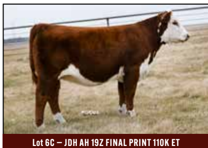
Lot 6C – JDH AH 19Z FINAL PRINT 110K ET