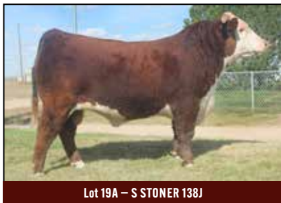
Lot 19A – S STONER 138J

For the first time in over 20 years, we have made the decision to offer Pick of the Pen, of our very best yearling bulls. Over the past 9 years, we have worked hard at find the right combination, phenotypically and genetically, that would advance our Line 1 based cowherd. We believe our pen bulls would fit anyone's program as each bull offers something unique. These three bulls were 2022 Cattleman's Congress Reserve Champion Spring Calf pen. We opted to keep them together and bring them back as a yearling pen and offer pick. Selling 3/4 interest and full possession.