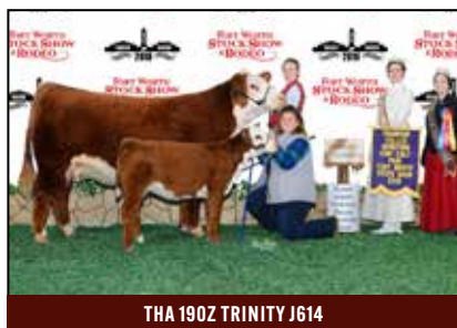
THA 190Z TRINITY J614