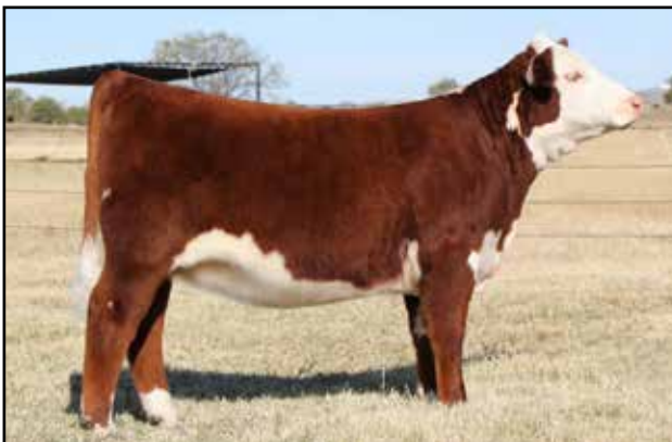
Lot 11 – CH MS 8212 RAELYNN 138 ET