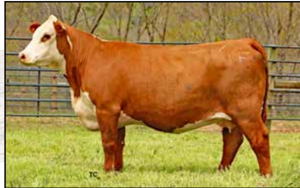
NJW 11B 81E RITA 24H ET