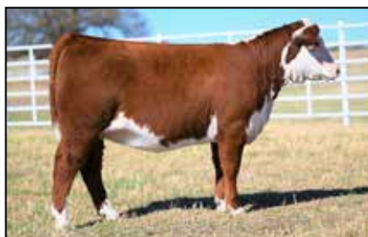
Lot 21C – SHR 105H EDEN 2333 ET