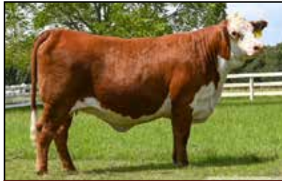
Lot 23A – VO TDF MISS BETH 072 J ET