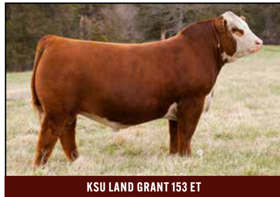
KSU LAND GRANT 153 ET