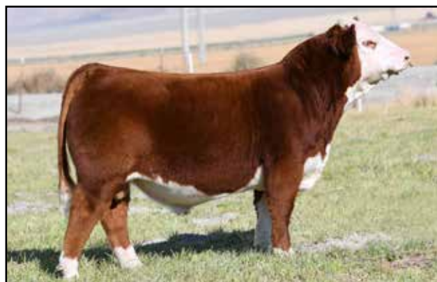
Lot 14 – BF 8029 THE RIO GRANDE 201K

BR BELLE AIR 6011 (CHB){DLF,HYF,IEF,MSUDF} SR RIO BRAVO 8029 ET (DLF,HYF,IEF,MSUDF,MDF) 43913855 HH MISS ADVANCE 5139R ET (DLF,HYF,IEF) GKB 88X BRYSON 37B ET (DLF,HYF,IEF,MSUDF) GKB 2103 37B SWEET THING 8137 (DLF,HYF,IEF,MSUDF,MDF) P44001047 BF 144U SWEET THING 2103 ET (DLF,HYF,IEF)