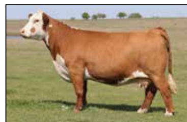
HAPP KOOL AID POINT 1218 ET Dam of Lot 9A, 9B and 9C