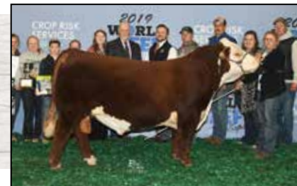
2TK PERKS 5101 CADILLAC 8039 ET