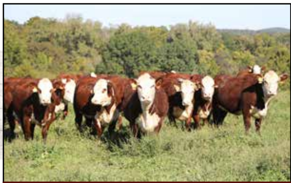
GROUP OF BRED HEIFERS

Purchased by Barnes Herefords in the 2021 Hereford Night in OKC Sale