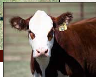
Lot 18 – BF SNAPSHOT 8J ET