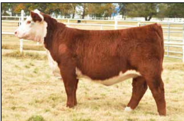
Lot 7 – EXR TKC ADDISON 2022 ET