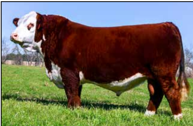
Lot 10 – C & L OSIRIS 9365 15J