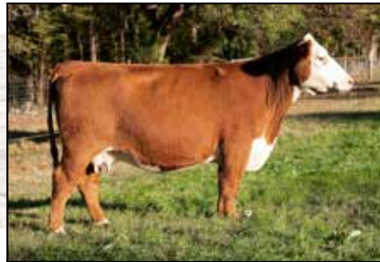
Innisfail 100W 839F