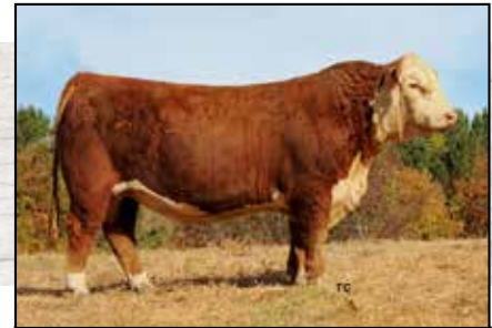
INNISFAIL WHR X651/723 4013 ET