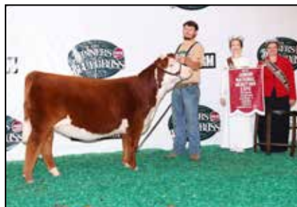
H CONGENIALITY 1898 ET

2022 Cattlemen's Congress Champion Horned Female