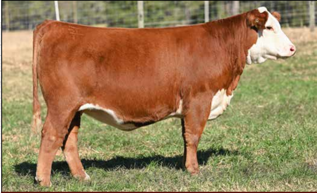
LOT 12 – INNISFAIL 4013 124J