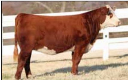
WMC B413 138G THYRA 210J