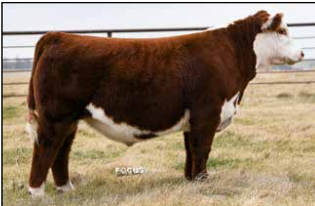
Lot 5 – JDH AH 19Z 36G UNITED 49K ET