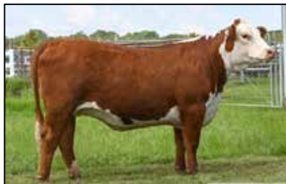
Lot 23B – VO TDF BECKY 074 J ET