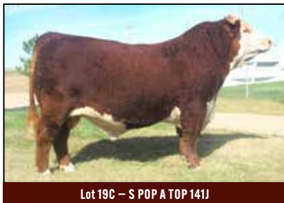
Lot 19C – S POP A TOP 141J