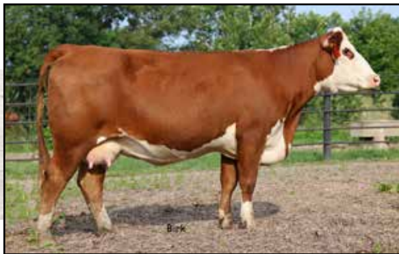
FTF FABULOUS 181Y

Maternal grandmother to many of the females available.