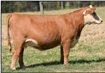
Innisfail 4013 1580 2014 ET