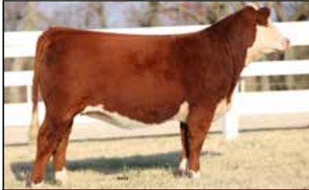
WMC 128D 52E OKSANA 205J

These two heifers are included in this pick.