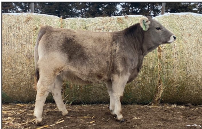
Miss BBB 2030 / Lot 24