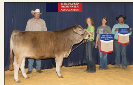
Supreme Champion at the TJBA Show