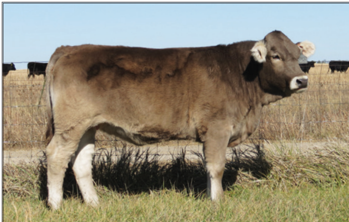
MS LOF Grace G569 / Lot 17