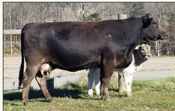
MS RDF 801C / Lot 4 Recip for Lot 4A