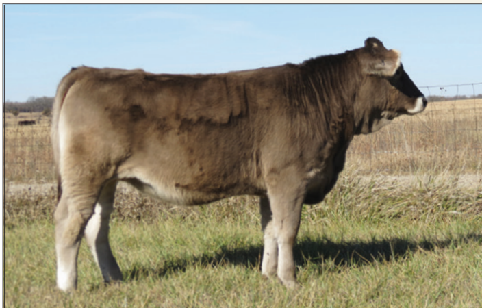
MS LOF Gretel G570 / Lot 18