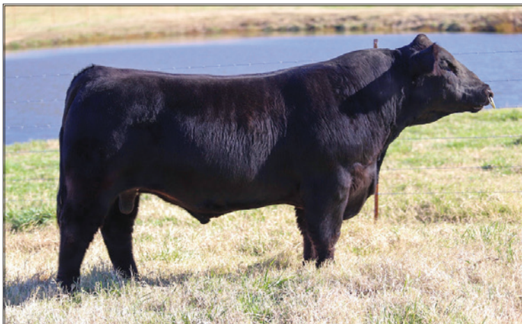
JMS Mr Rocky G127 / Lot 15