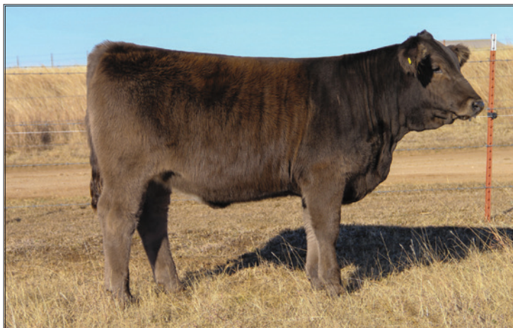
BLC BLU JBB Sweet Maria / Lot 2