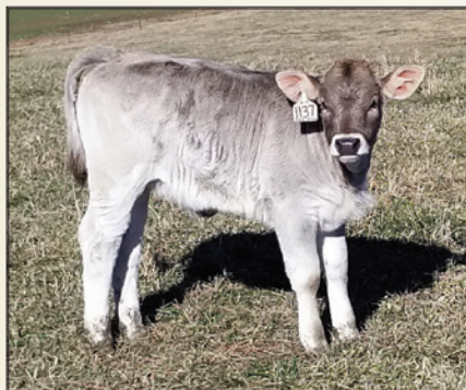
MS RDF Jasmine 1137H ET / Lot 4A

Own one of the 1st Swiss Tradition Ivan calves in the US!