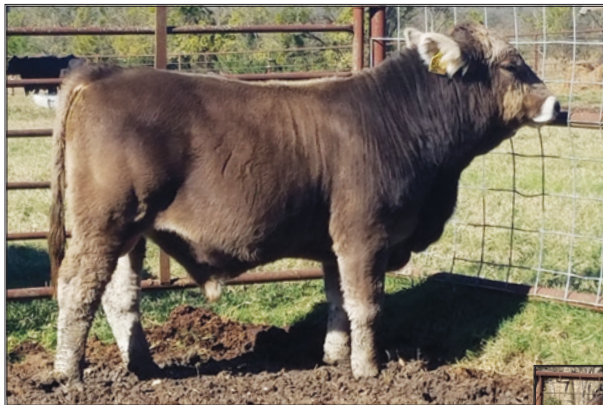
Mr BLU 025G / Lot 12

SGP Nuts & Bolts 959E Sire of Lot 12 & 13