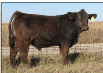
BLU BLC JBB Parson 451D ET / Maternal brother