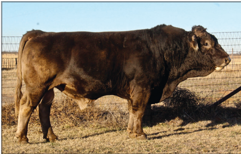
TLC Vigor Z2119 / Lot 7