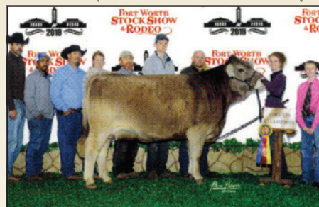
Champion Female 2019 FWSSR