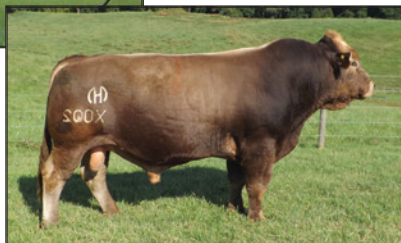
MHF Xerox X002 / Sire of Lot 10