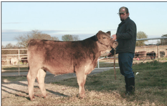
Alexander Beaumont Patty / Lot 28

This polled Purebred heifer is out of a great uddered dam that has produced an eye catcher the past three years! She is very balanced and feminine fronted, with expressive muscle in her top and lower quarter, great spring of rib, and walks with a long stride. This all combines into a complete package for a purebred operation or elite show heifer project!