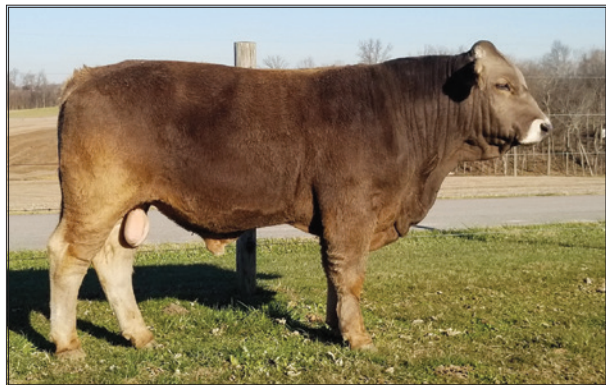
WW Spittin Image 974G / Lot 9