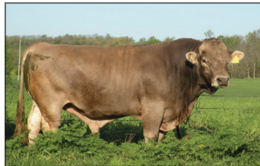
Mr Bocephus Boy / Sire of Lot 20 and the maternal grandsire of Lot 19.

Full blood heifer with good genetics going back to Sambo, Spitten Image, Tennessean, Double Time. A Dragon daughter G7210. She is sired by MR TNB Yuma and is broke to tie.