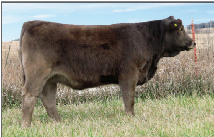
BLC BLU JBB Our Maria / Lot 3