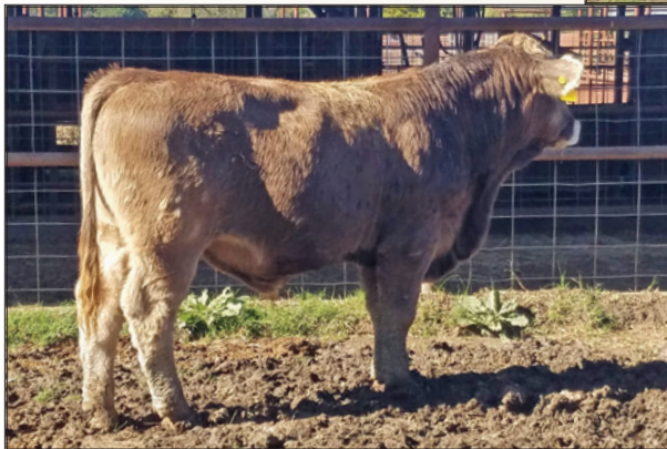
Mr BLU 107G / Lot 13