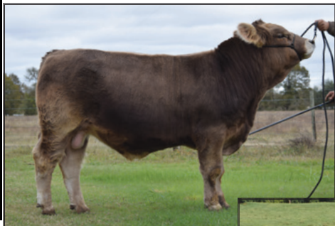
PRAZ Mr 03G / Lot 10