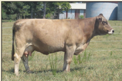
WW Fieldstone Jasmine 229Z ET