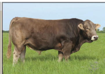
BLC Toronto 618B / Sire of Lot 1, 2 & 3