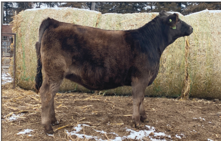
Miss BBB 2010 / Lot 22