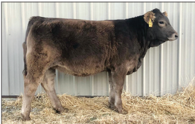
WCCR Mercy Me 0041 / Lot 27