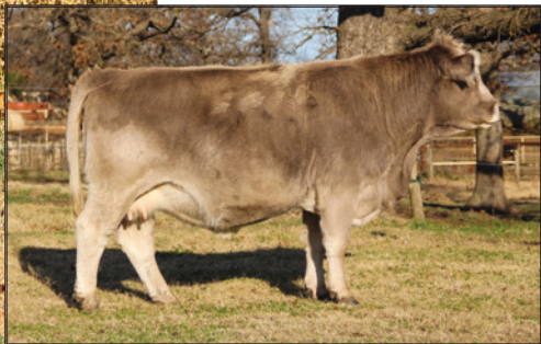
SG BLC Ozportunity D901 Dam of Lot 14