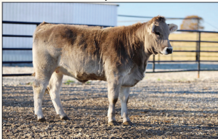
Miss Maya G133 / Lot 38

The proceeds of this Purebred heifer are going to support the JBAA for the Junior National in Texarkana 2021.