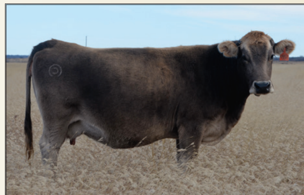
BLC Vader's Leia 505U / Lot 5