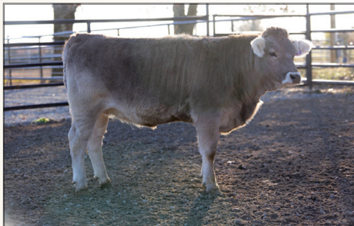
Miss Kinsley G135 / Lot 37

The proceeds of this Purebred heifer are going to be split in half. One half will go to support the Bonanza and the other half to support the Full-Blood Cup.