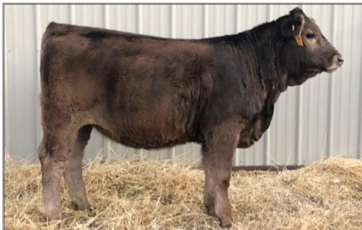
WCCR Miss Haven 0081 / Lot 31