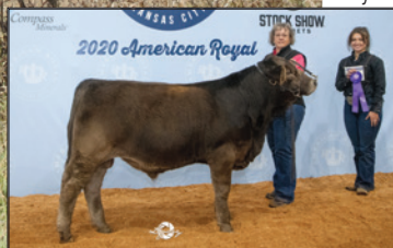
BLC BLU JBB Ontario ET / Lot 1