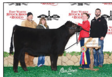
Miss DSB Chocolate Muffin Dam of Lot 15