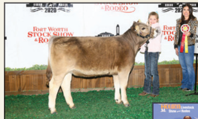
SAR MISS MOLLY Maternal Sib to Lot 29 Reserve Grand Champion Purebred 2020 FWSSR Junior Show