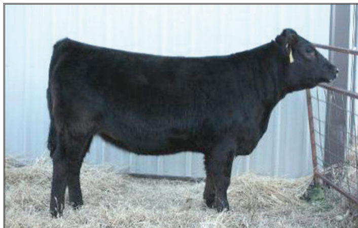
WCCR Seize The Day 0012 / Lot 32

This polled May Purebred heifer may be young, but definitely is one not to miss! She is out of a 10-year-old dam that we have kept many replacements from. She will be moderate framed, but very deep middled, square hipped, level topped, and smooth shouldered. She is very hard to let go knowing how well her sisters have perform for us in the past!