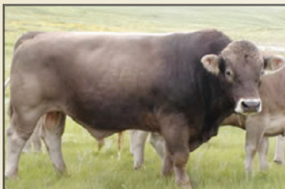
Swiss Tradition Ivan / Sire of Lot 4A