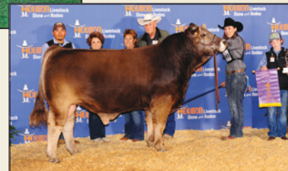
MAE MAGNUM PI / Sire of Lot 29