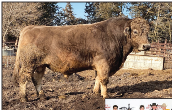
MAE Monte Walsh ET / Lot 8

2020 FWSSR Grand Champion Female Sired by Monte Walsh