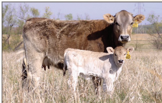
BLC Vader's Leia 505U / Lot 5, pictured as a 2 year old