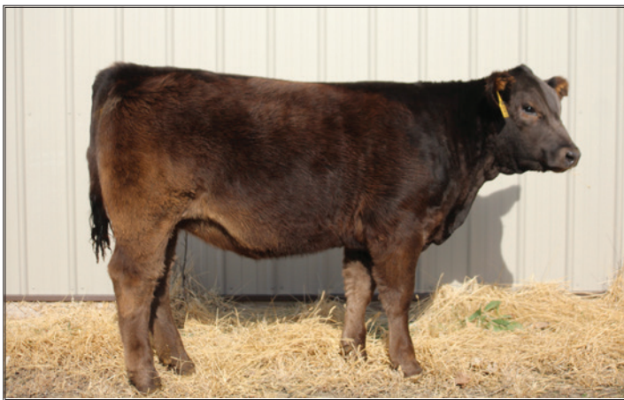
WCCR Sweet Jubilee 0021 / Lot 23

Beautiful Bojangles daughter. She carries a proven, predictable pedigree on top and bottom. Long, feminine female who is big bodied and super level hippped, halter broke and ready to go.