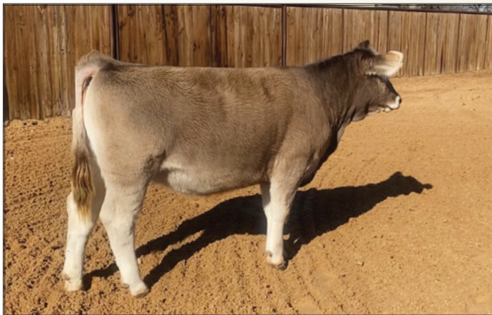
Star Sue Ellen 16H / Lot 29