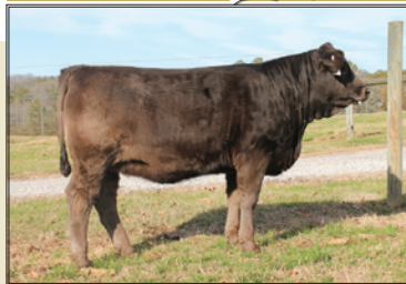
WW My Maria 454B / Dam of Lot 1, 2 & 3

Selling full interest, full possession in all three of these lots.