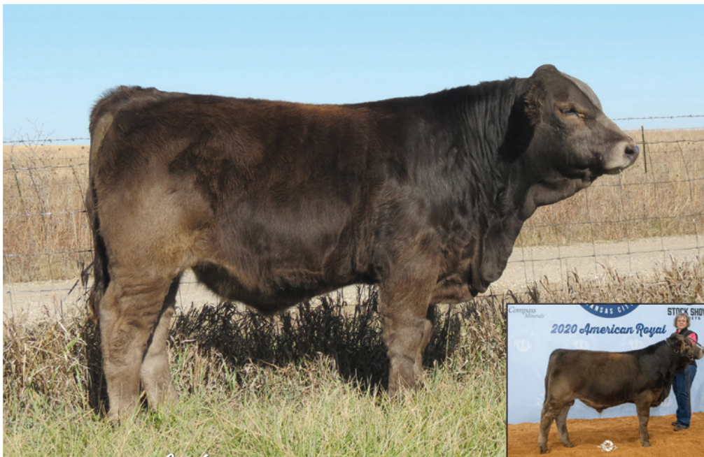
Lot 1 BLC BLU JBB ONTARIO ET