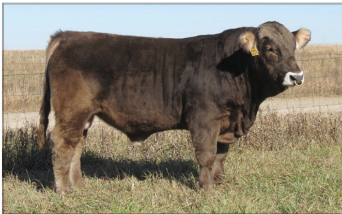
MR ECL General Grant G571 / Lot 11